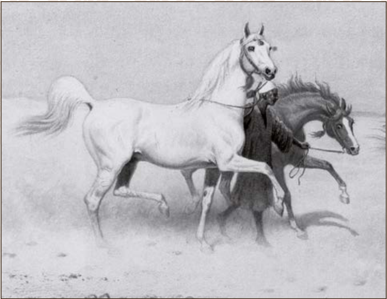
Horses of the Desert by Harrington Bird