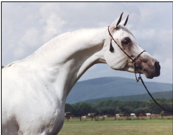
Prince Fa Moniet (TheEgyptianPrince x Fa Moniet by Ibn Moniet El Nefous)

Refky was a tall bold chestnut horse born in Egypt who had a racing career before being imported to the U.S. He was a maternal half brother to the EAO sire Mohawed (x Alaa El Din). TheEgyptianPrince was a full brother in blood to Ansata Shah Zaman. He was smaller horse, quite refined with a handsome noble expression and nicely shaped head with small muzzle. There was style and agility to his movement. Perhaps TheEgyptianPrince's most internationally renowned son is Prince Fa Moniet, sire of many excellent Ansata bred mares as well as the important sires AK Shah Munifeh (x AK Munifeh), Ansata Iemhotep (x Ansata Nefara) and Ansata Sinan (x Ansata Nefara). In his lifetime TheEgyptianPrince was to prove a very popular sire producing 826 foals. He also may have been the longest living Morafic son living to age 28. The chief sire at Bentwood was Ibn Moniet El Nefous, the result of breeding Morafic to his granddam making him 62.5% Moniet El Nefous blood, the highest in any Egyptian. He was imported to the