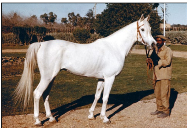
Images of Morafic as a young horse in Egypt.