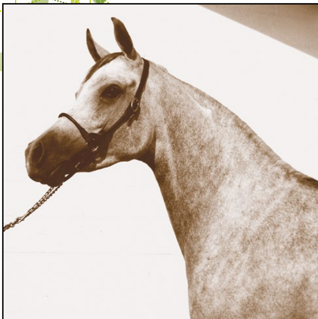
The beautiful Nahlah (Morafic x Mohga by El Sareei) many times U.S. National winner in halter and performance.

That same year was the second Arabian Horse Fair and it was an even bigger event than the year before. Included in the stallion row were 24 straight Egyptian stallions among which were seven Morafic sons and four grandsons: Ansata El Emir (Morafic x Ansata Sabiha by Ansata Ibn Halima)