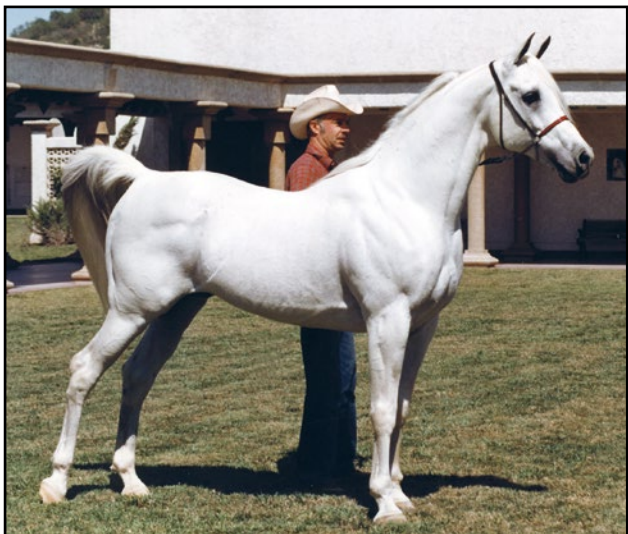
Al Metrabbhi (Morafic x Samarra by Morafic) shown here in old age when on lease to Gleannloch

Hamid Ibn Morafic (Morafic x Somaia by Anter)