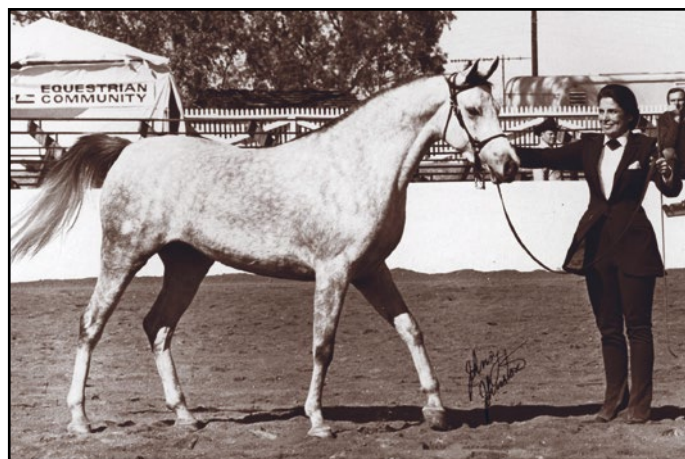
Dalia (Morafic x Romanaa II by Sameh) Many times champion and dam of Imperial Imdal.

Morafic's grandson Sakr had again returned to the stallion row at the Fair. Again he was a crowd favorite as a brilliant performer in the show portion of the Fair. His son, Nabel was also in the stallion row. The young Nabel was to later