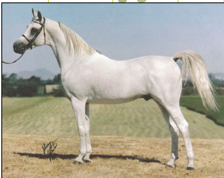
Ibn Moniet El Nefous (Morafic x Moniet El Nefous).