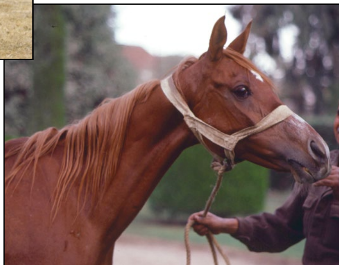
The lovely Farfoura (Morafic x Bint Mona) full sister to TheEgyptianPrince, Il Muna and Norra. She was foaled prior to her dam being imported with Morafic. She remained a broodmare for the EAO.