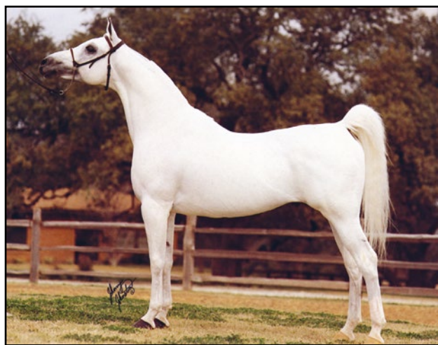
TheEgyptianPrince (Morafic x Bint Mona).

It was only natural that our next visit be to Bentwood Farms in Texas where three sons of Morafic were at stud: Refky (x Rafica by Nazeer), TheEgyptianPrince (x Bint Mona) and Ibn Moniet El Nefous (x Moniet El Nefous).