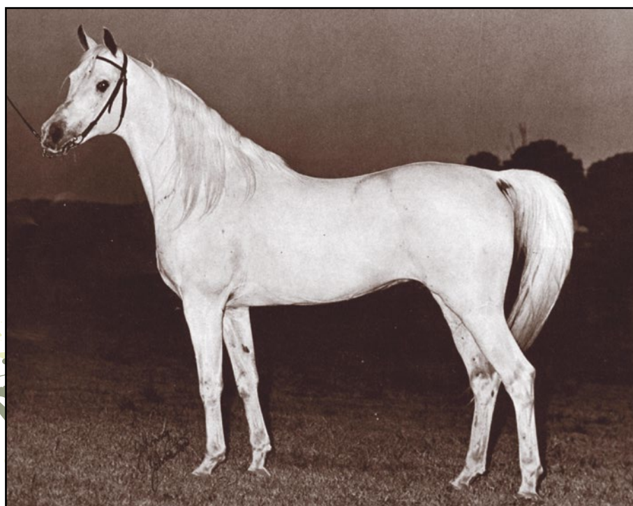
Morafic in his prime at Gleannloch Farms.

mind ed me it was something bigger. It was not just Morafic but it was the vision of the noble horse that is supreme and timeless, the gift of Allah that is unequalled. It is what we all look for in the ideal Arabian horse. It was that special, almost indescribable essence that stops us in our tracks. In Khofo's