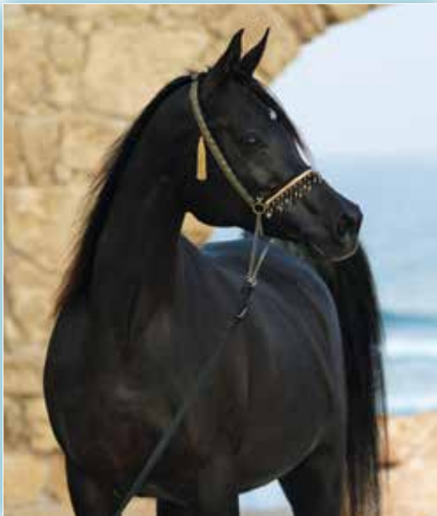
The Vision HG