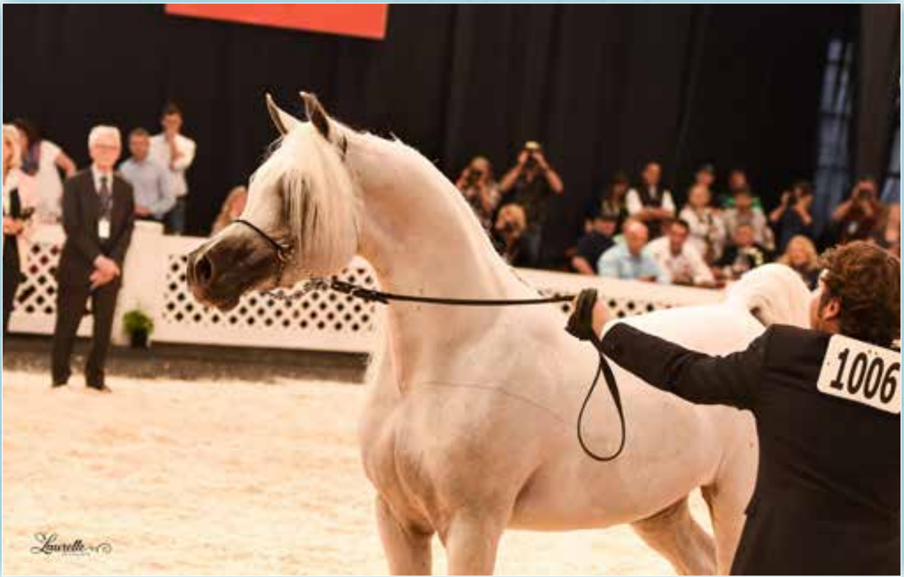
Al Ayal AA - Scottsdale 2016.