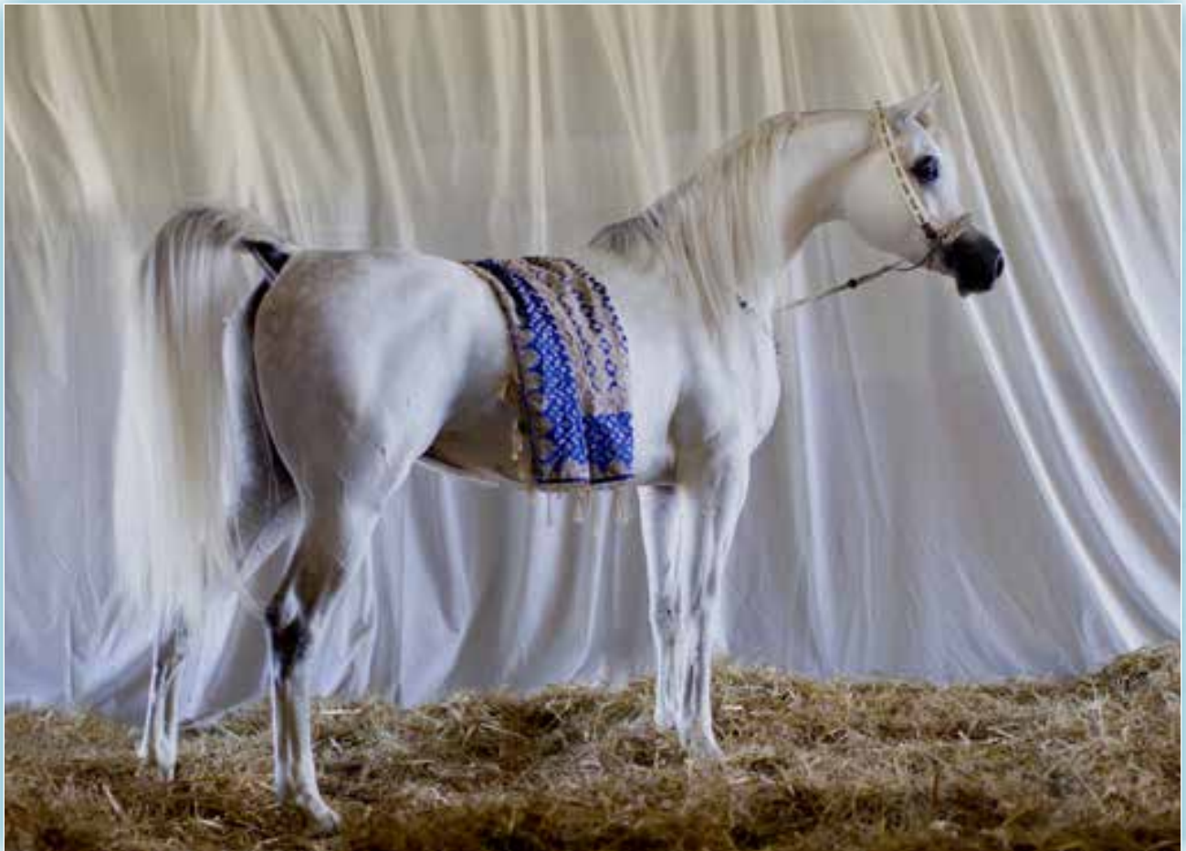
Al Ayal