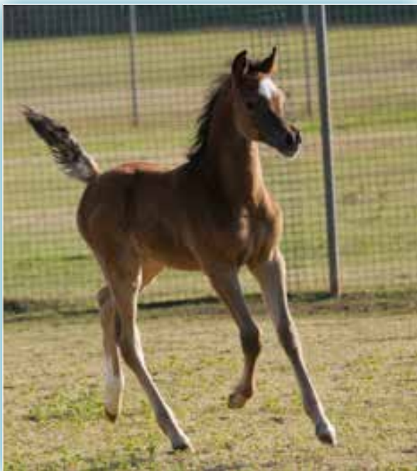
Al Ayal AA as a foal.

Not just another beautiful Arabian show horse inspiring worldwide admiration, Al Ayal has been an absolutely transformational catalyst advancing international relations, understanding, and good will across formidable political barriers. He has made history by opening more doors between Israel and her Arab neighbors than any other Arabian horse before him.