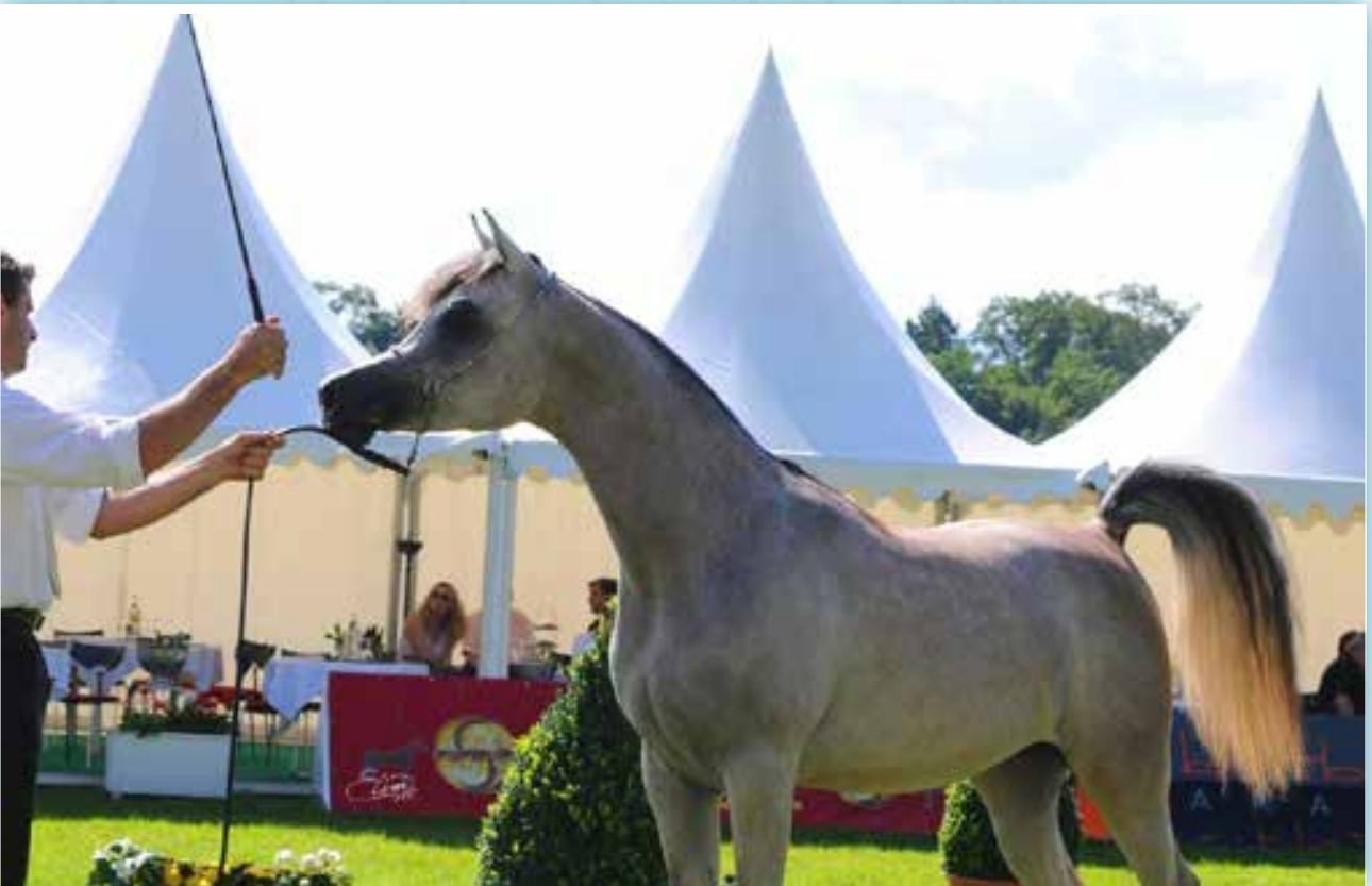
Al Ayal AA as a yearling during the Baden Baden show in Germany.