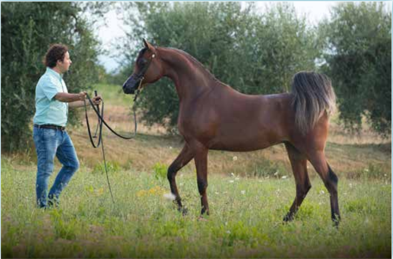
Qutuz AlJassimya (Al Ayal AA x Minwah).

Egypt, and the full sisters Sofiya AA (x Saniyyah RCA) and Soraya AA (x Saniyyah RCA), leased to Aria International in the USA and Hanaya Stud in Switzerland respectively.