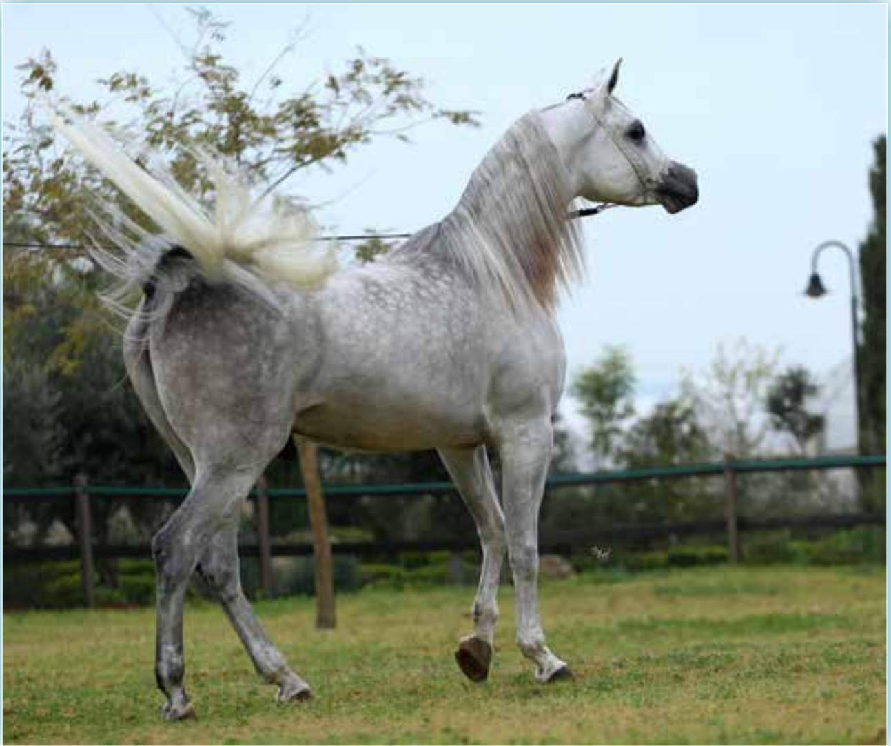
Shabeen AA (Al Ayal AA x Saniyyah RCA).