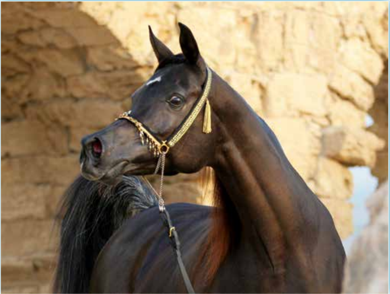
The Vision HG

Eventually, before he was even a year old, Al Ayal left Israel as an emissary to represent Ariela abroad and soon began making history. A shared passion for Arabian horses makes for strange bedfellows and the colt was leased for three years on behalf of the Ajman Stud in the United Arab Emirates, this despite the fact that, even today, ten years later, Ajman and Israel have yet to establish formal diplomatic relations.