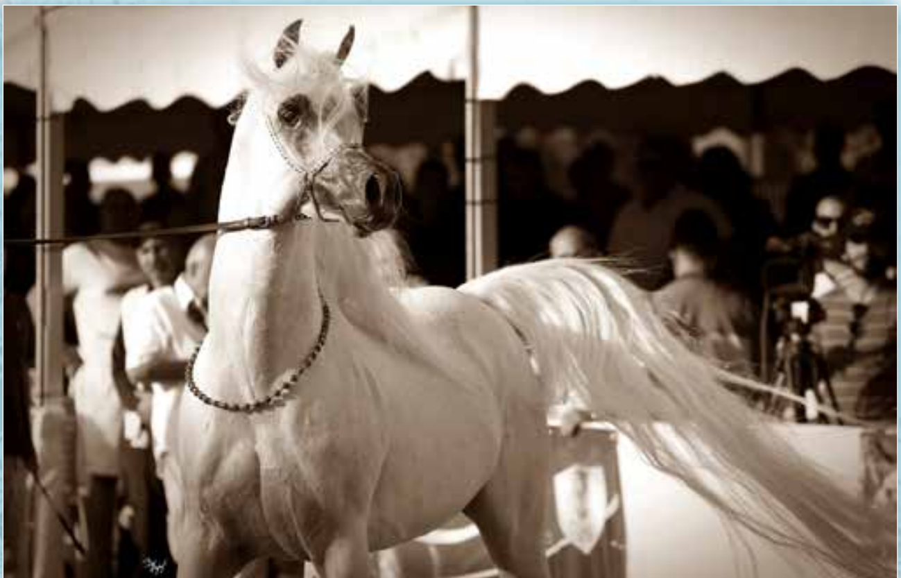
Al Ayal AA - Getting the WAHO Cup in Israel 2017