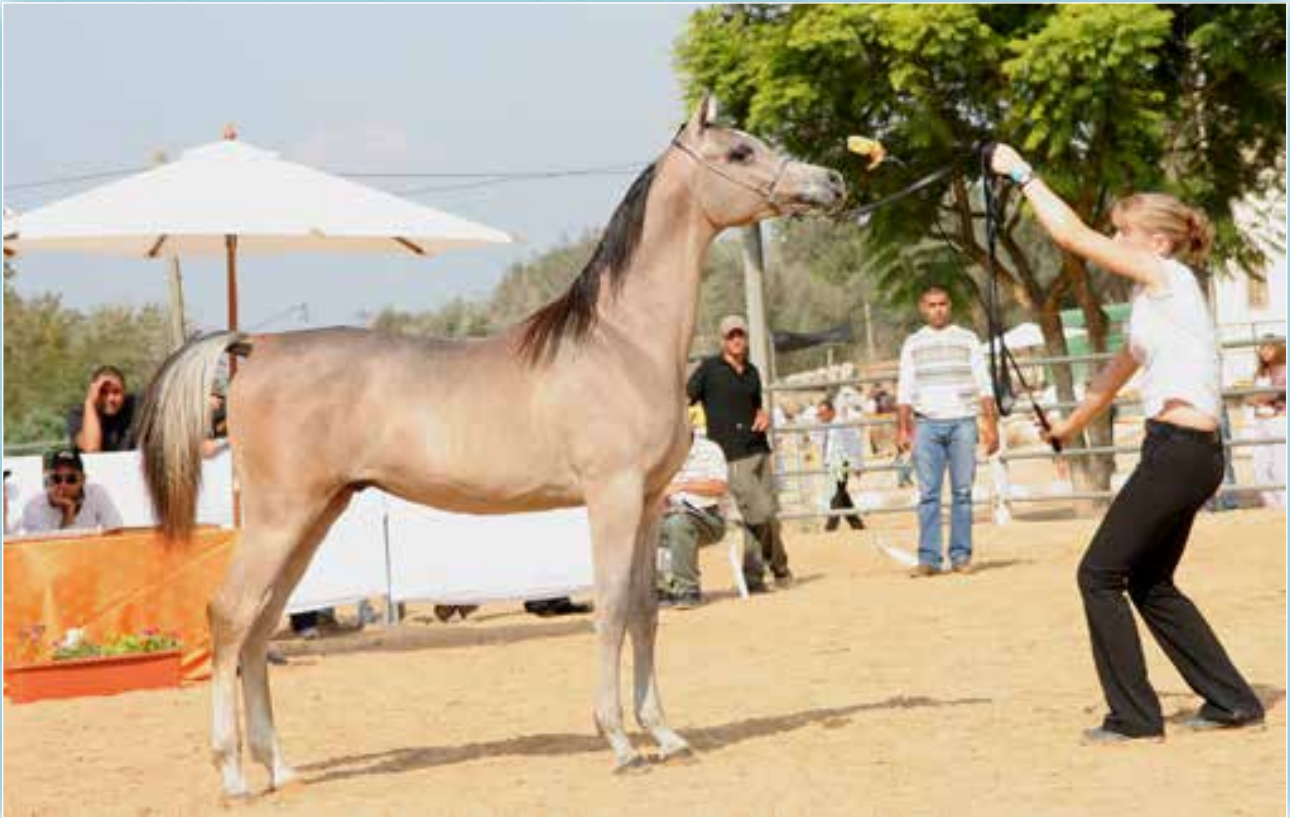
Al Ayal AA - Weanling Colt Gold Championship at the 2008 Israeli Nationals