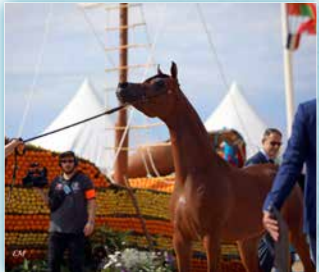
Qutuz AlJassimya.