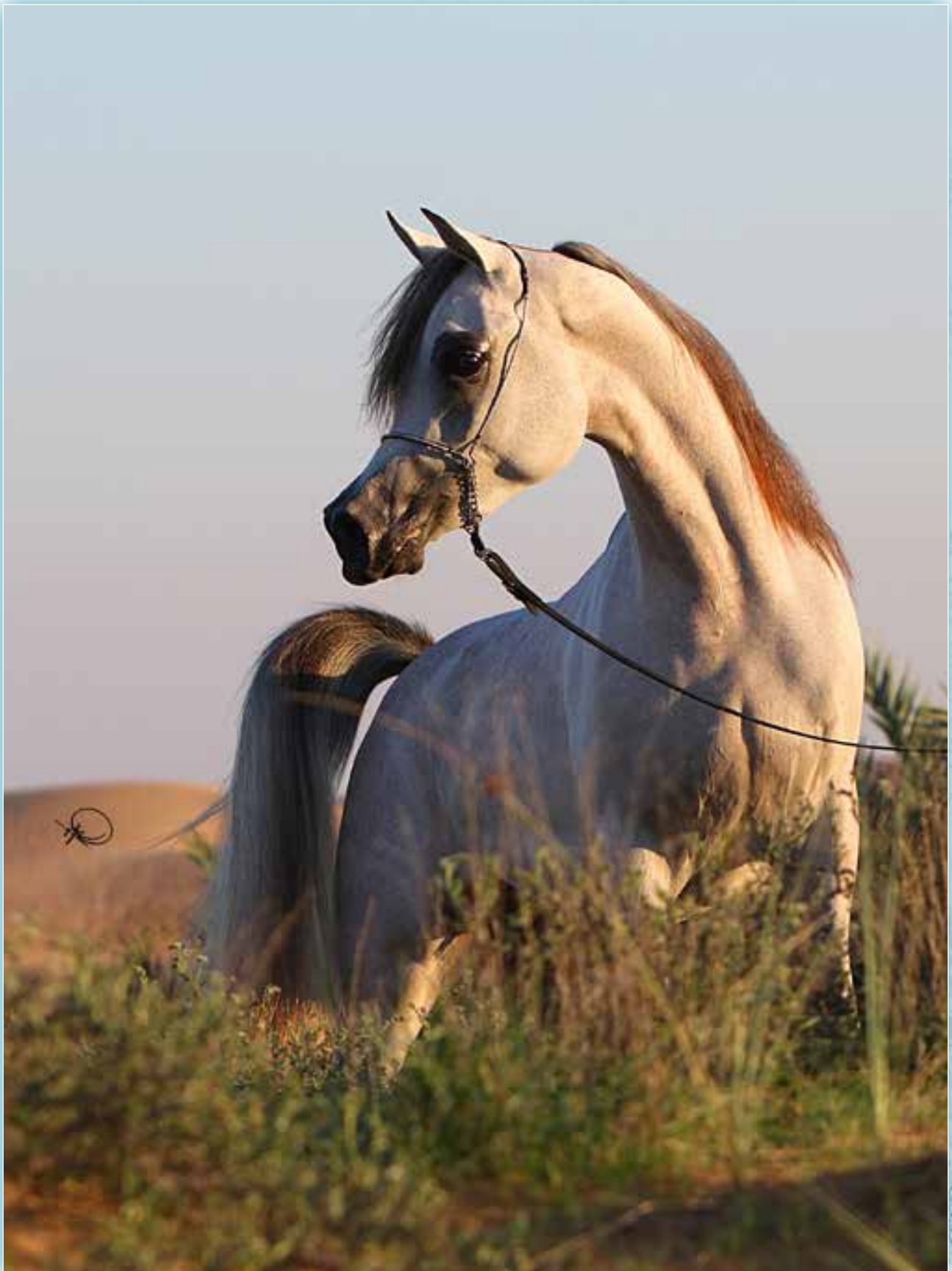
Al Ayal AA during his lease to Ajman Stud 2010.