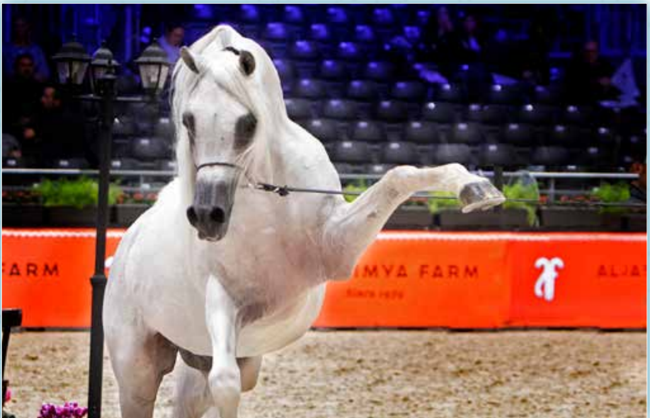
Al Ayal AA - World Championship Paris 2018.