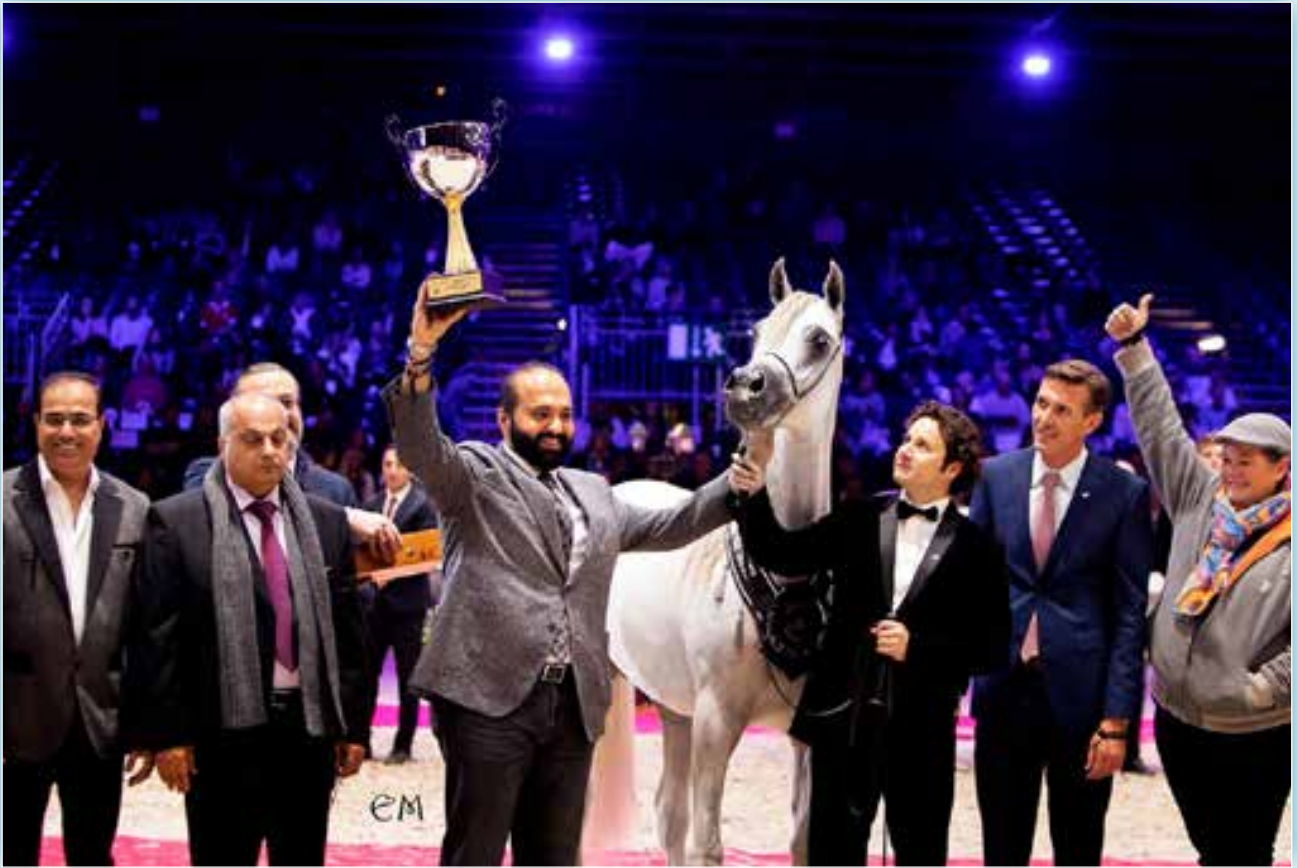
Arraab Aljassimya (Al Ayal AA x Om El Aisha Aljassmya).