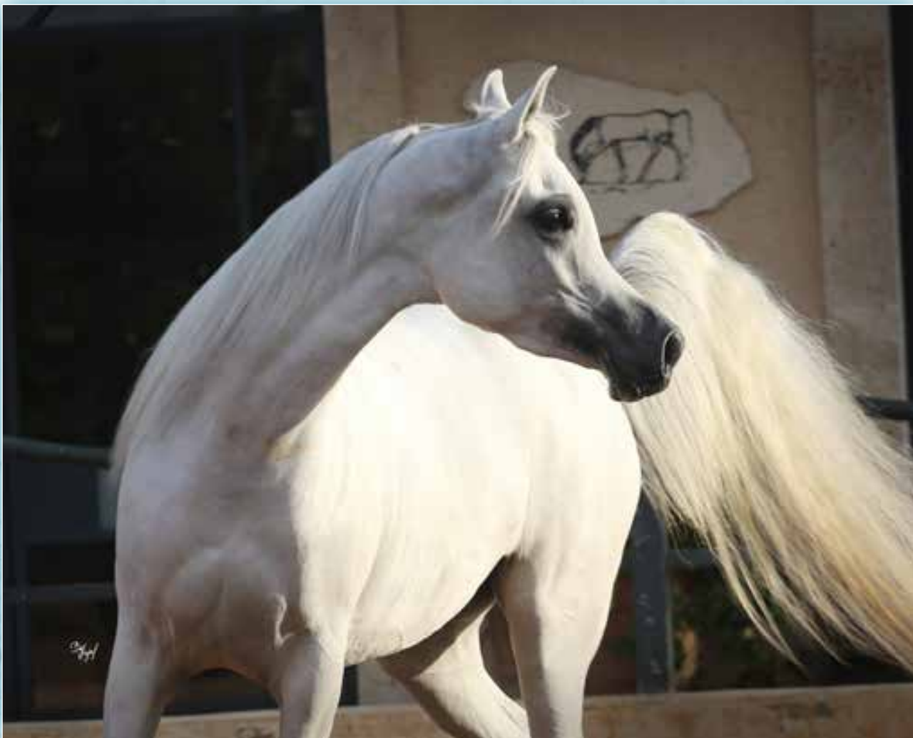
Sofiya AA (Al Ayal AA x Saniyyah RCA)