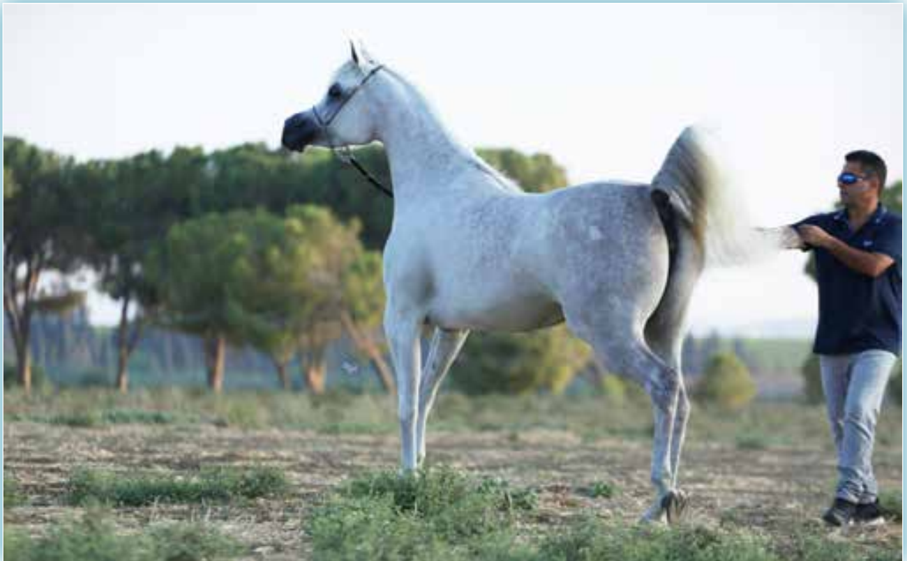
Turkiz AA (Al Ayal AA x JPJ Talsasha)