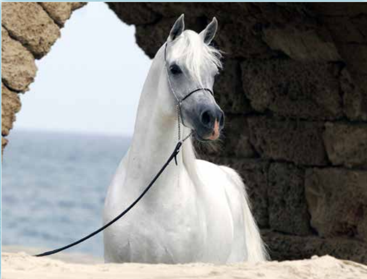
Al Ayad

Right from the start it was Al Ayal AA, the younger of two Al Ayad colts out of The Vision, that was the most outstanding of an excellent group of foals. From a very young age Al Ayal appeared to be almost an archetype of the ideal modern show colt, portraying exquisite quality, great charisma, and extraordinary type. Perfectly in balance and extremely refined, he raised the standard for what was seen as perfection in a straight Egyptian show colt.