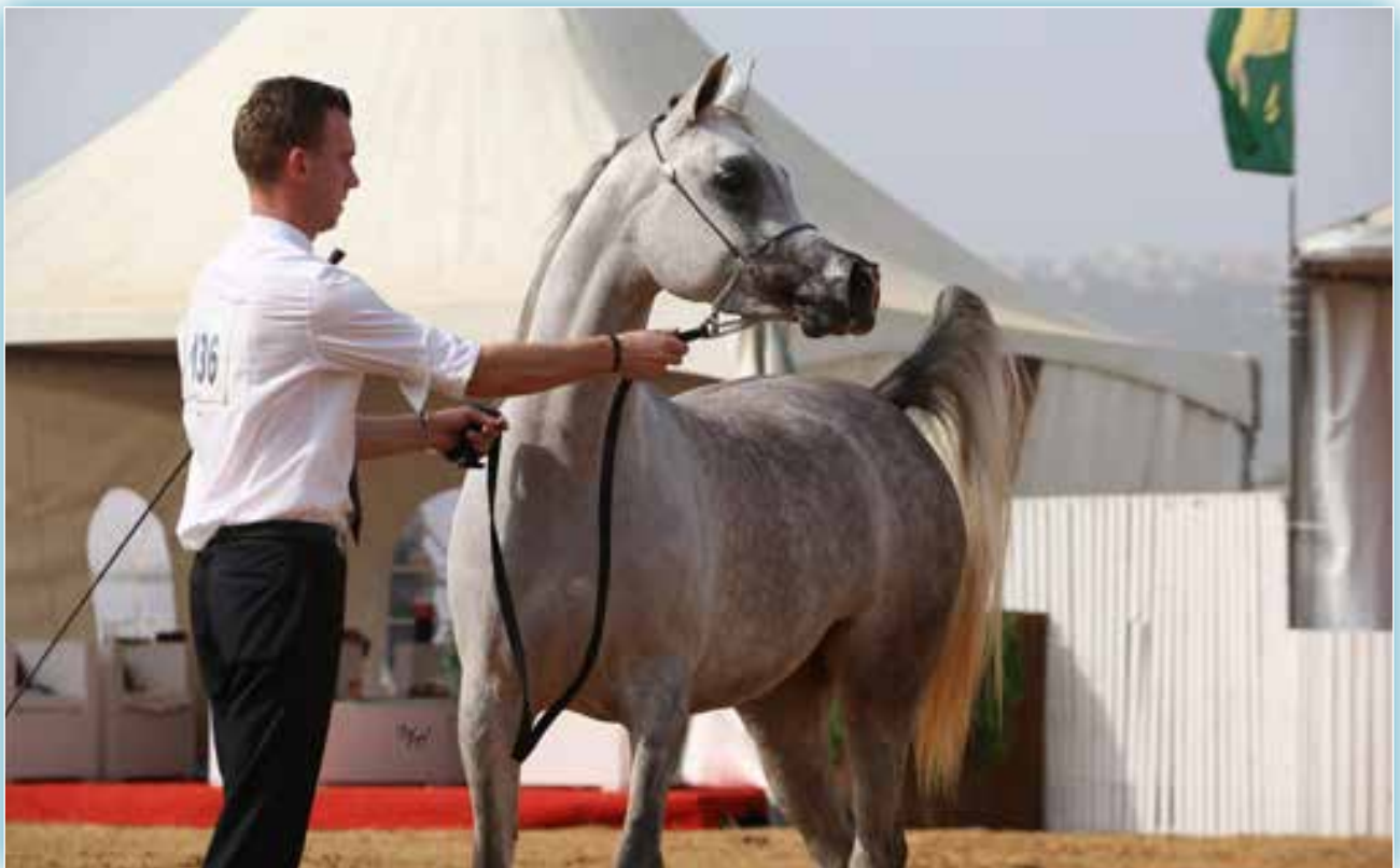
Sajida AA (Al Ayal AA x Safiyyah AA )