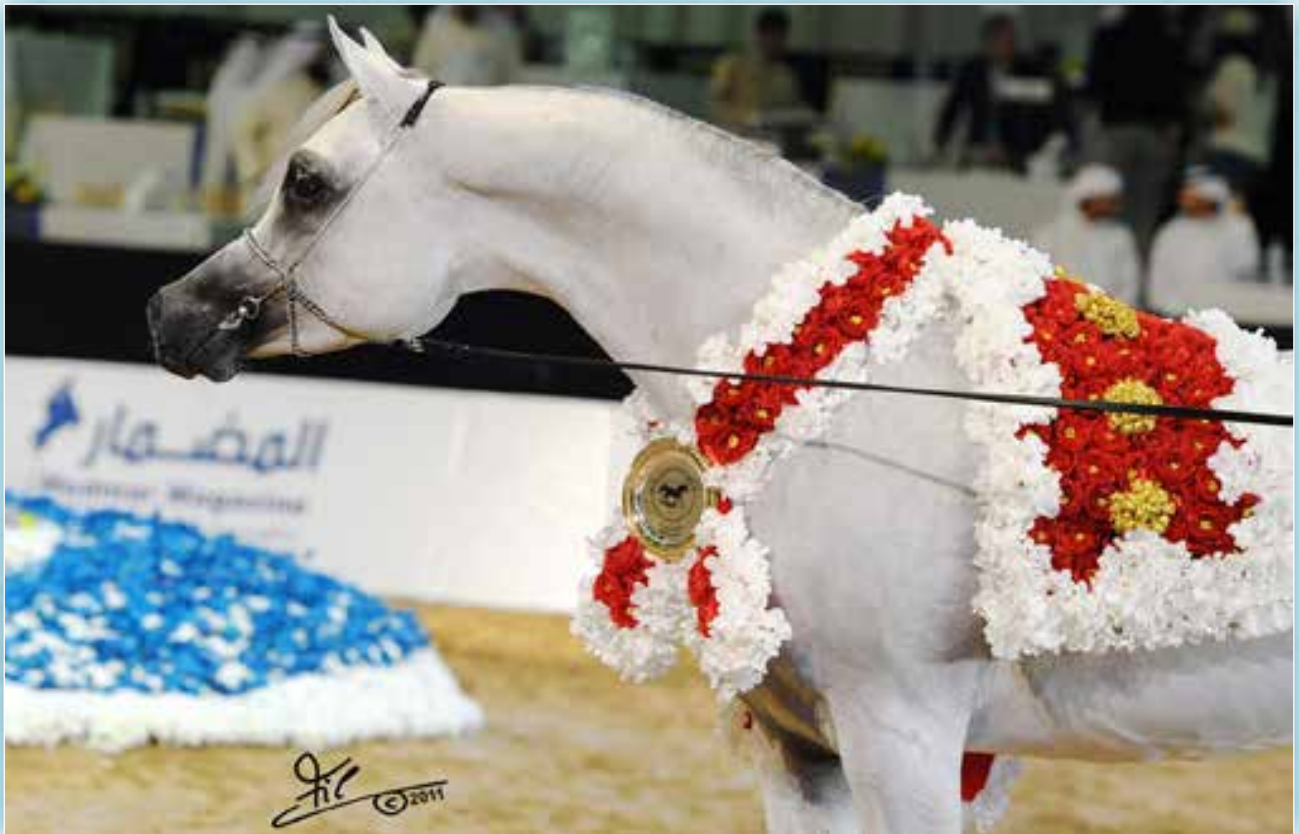
Al Ayal AA - Dubai 2011.