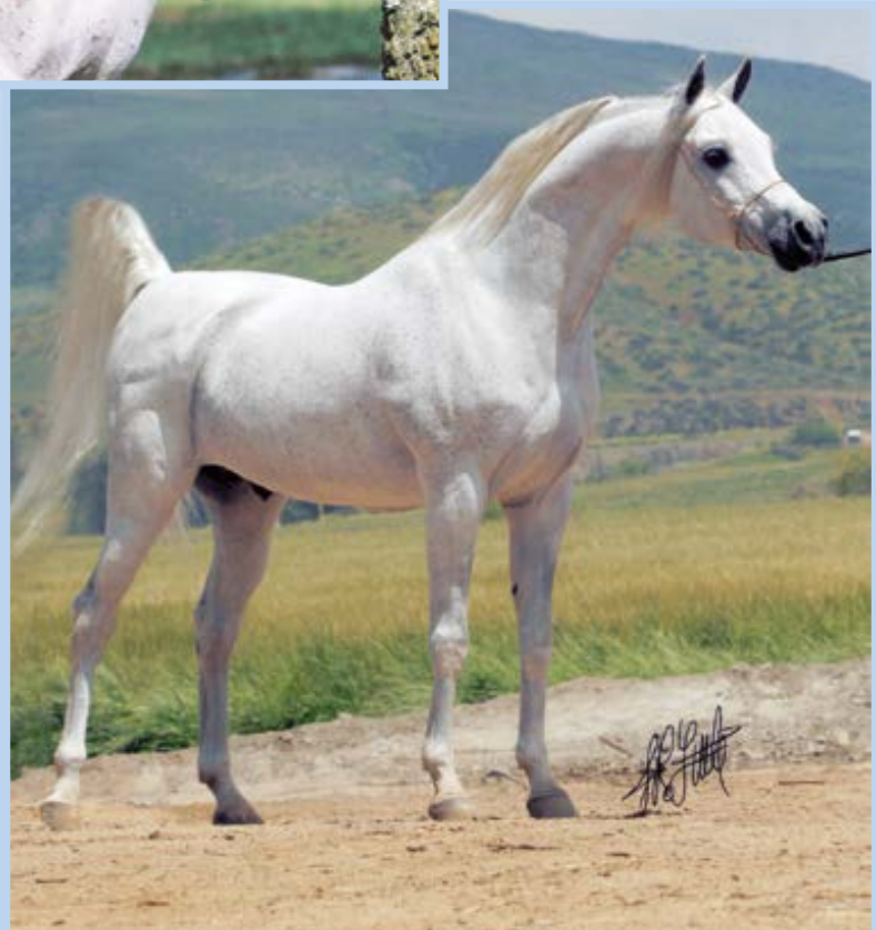
HS Hero 1998 grey stallion (Simeon Sadik x Helwa Lancer by El Hilal). Imported to the U.S. from the U.K. in 2002. A sire of champions for Abraxas Arabians.

owner of Simeon Shai, thus multiplying the crosses to El Hilal.