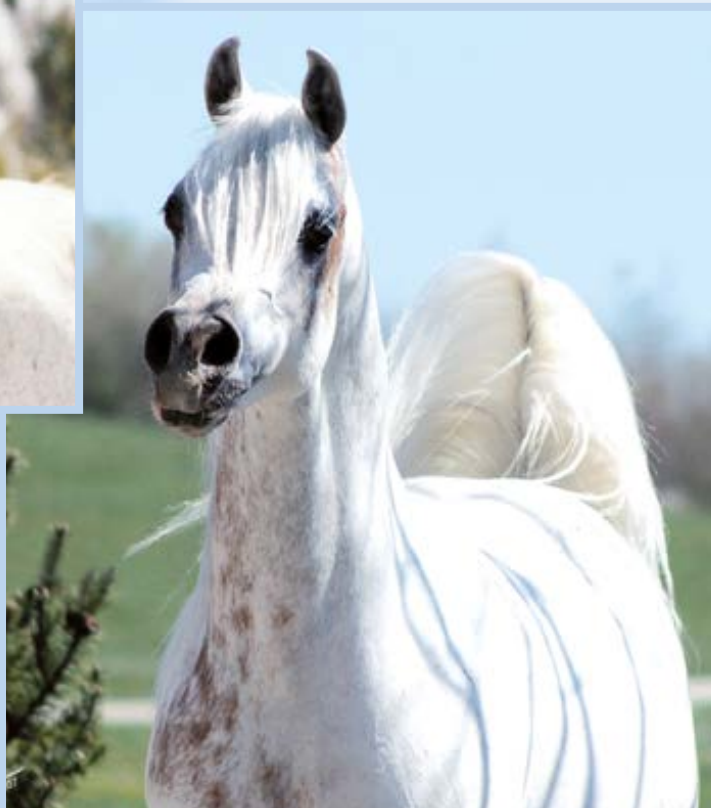
WH Justice, "the champion maker" 1999 grey stallion (Magnum Psyche x Vona Sher-Renea). He traces to El Hilal on his dam's side.