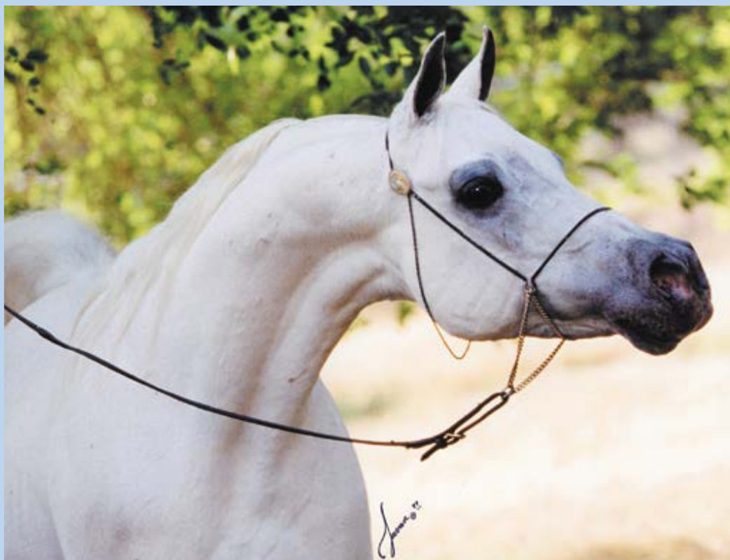
El Halimaar 1980 grey stallion (Ansata Ibn Halima x RDM Maar Hala by El Hilal) U.S. National Top Ten Futurity stallion and international sire of champions.