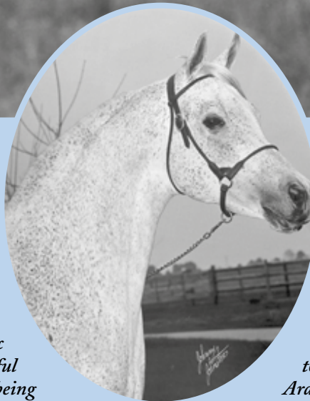
Ansata Ibn Halima 1958 grey stallion (Nazeer x Halima), One of the two most influential Nazeer sons of all time, admired by many.