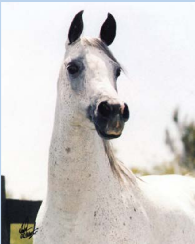
RDM Maar Hala 1973 grey mare (El Hilal x Maar Jumana). An all time leading straight Egyptian dam of champions (and grand dam too). She had those lovely big dark eyes s o often coming from El Hilal.