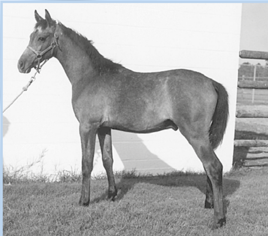
El Hilal as a foal at Gleannloch.

combination of Ansata Ibn Halima blood with Bint Nefisaa was a great cross. Interestingly a similar type of breeding was playing out at the famed Weil-Marbach stud in Germany. Ansata Ibn Halima's three-quarter brother Hadban Enzahi, was being bred to Bint Nefisaa's full sister Nadja, five times producing such notables as the mares: Nayla, Nabya, Noha and Nedjari. Clearly, these ingredients were magical as illustrated by the beautiful mare RN Farida (Salaa El Dine x Noha).