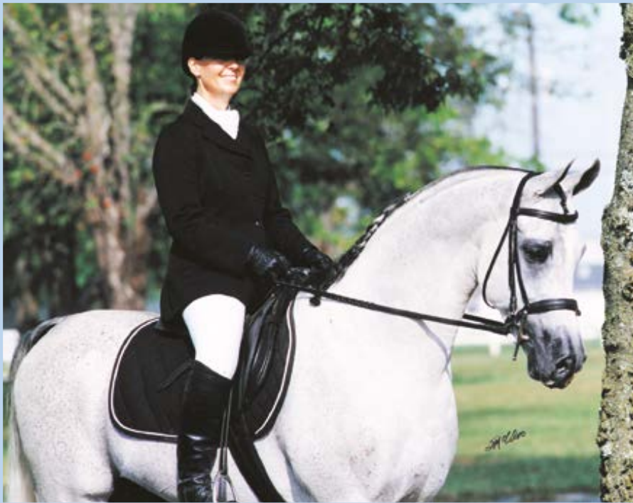
Abraxas Halimaar 1990 grey stallion (El Halimaar x SF Moon Maiden, out Kachina Moon). A double El Hilal bred champion. He was U.S. and Canadian National Top Ten, Egyptian Event Supreme Champion stallion and a regional dressage champion.