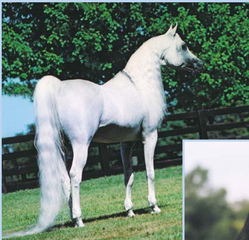
Imperial Al Kamar 1987 grey stallion (El Hilal x Imperial Sonbesjul) the most heavily used straight Egyptian son of El Hilal and a sire of international champions.

Sons of Imperial Al Kamar went to countries such as Belgium, England, Chile, Australia, Israel, Morocco, Egypt, Qatar and the Emirates. Among his most memorable champions are the very charismatic Imperial Kamilll U.K. Senior Champion and Paris World Top Ten, and the unforgettable mare Kamasayyah (x Sundar Alisayyah) a champion filly throughout the Middle East as well as Jordanian International and Qatari National Champion Mare. Imperial Al Kamar's beautiful daughter Imperial Kalatifa (x AK Latifa) was not only an Israeli Reserve National Champion filly but also dam of the exquisite World Champion mare Loubna (x Imperial Imdal).