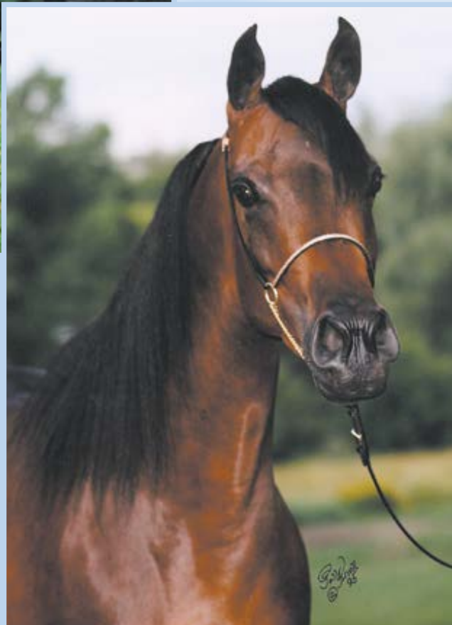
HiFashion Hitesa 1983 bay mare (El Hilal x Yasamin) grand dam of Egyptian Event Supreme Champion stallion The Elixir.

And the list goes on and on. El Hilal has clearly proven himself a superior and consistent sire for many qualities that we desire in good Arabians and as a result is a real treasure in Arabian pedigrees of today. The once small and slow maturing colt who eventually blossomed into a champion and, more importantly, a sire of many Arabians of championship quality whether shown or not, has proven that good things are well worth waiting for. □