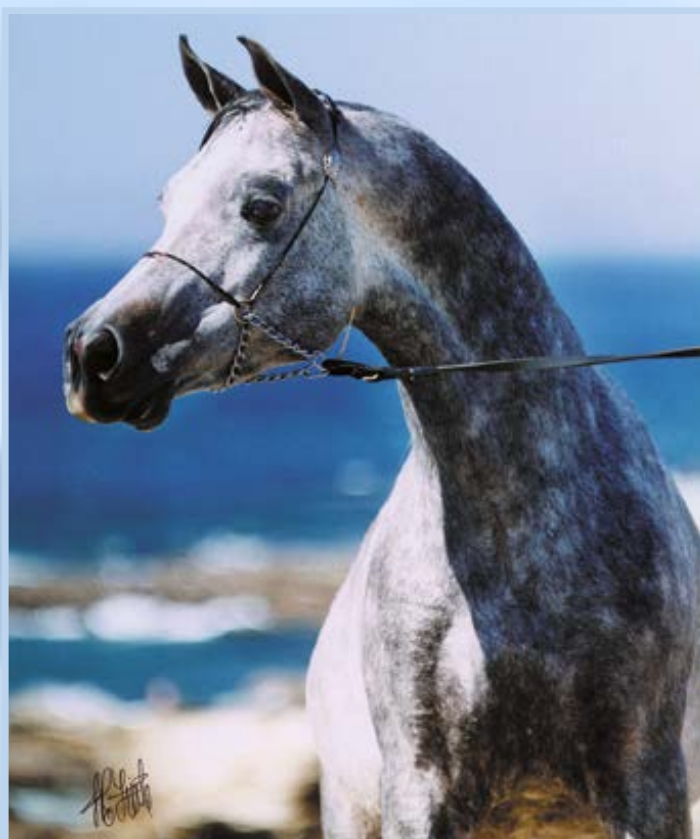
Halilulya MH 1995 grey stallion (El Halimaar x RDM Maar Hala). A beautiful stallion, the product of breeding El Halimaar to his dam.