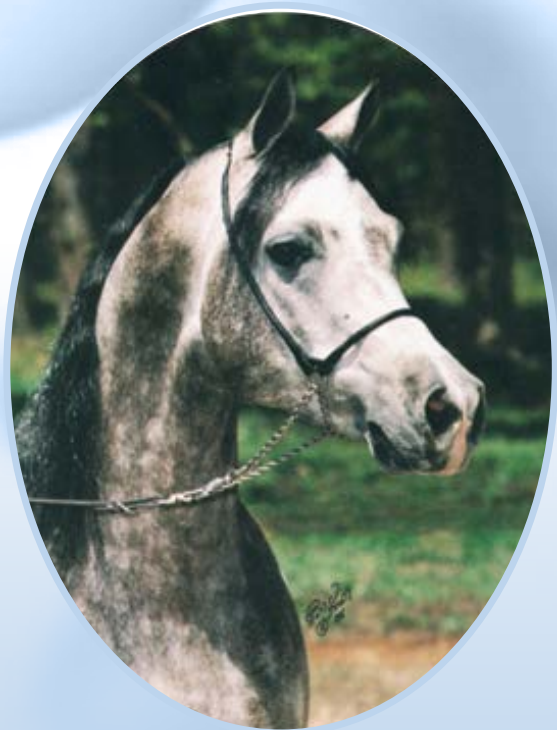
Prince Ibn Shaikh 1981 grey stallion (Shaikh Al Badi x RDM Maar Hala by El Hilal). U.S. and Canadian National Top Ten stallion and sire of champions.