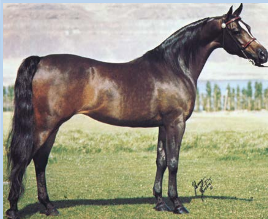
Ebony Moon 1974 bay mare (El Hilal x Esperanzo Mara) A classic example of the show winning get of El Hilal. She won Canadian National Reserve Champion Mare as a three year old.

influential worldwide. Her first son, ET Crown Prince (x TheEgyptianPrince) himself a multiple champion, was a consistent sire of champions in Class A shows and at the U.S. Egyptian Event. His son Ra'adin Royal Star, out of the Tuhotmos daughter Om Khamsa, was exported to Australia where his fame would become everlasting via his world famous son Simeon Shai, U.S., Canadian and Paris World Champion. RDM Maar Hala's next two sons were both sired by Ansata Ibn Halima producing the bay stallion Halim El Mansour and the grey El Halimaar, between them siring nearly 200 foals.