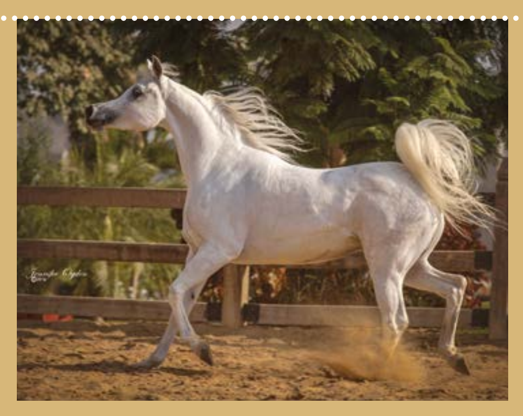
Dana Al Baydaa (Jamil Al Rayyan x Gawaher Al Baydaa) Bred and owned by Al Baydaa stud, Egypt