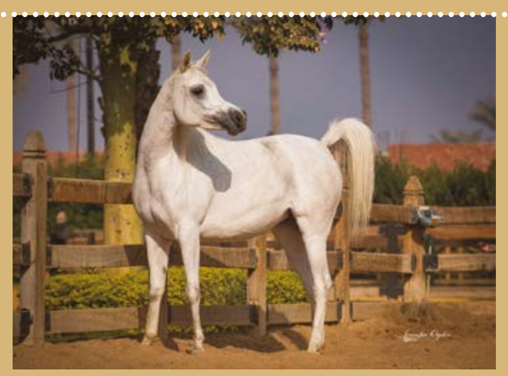
Narges Al Baydaa (Jamil Al Baydaa x Princes Al Baydaa) Bred and owned by Al Baydaa stud, Egypt