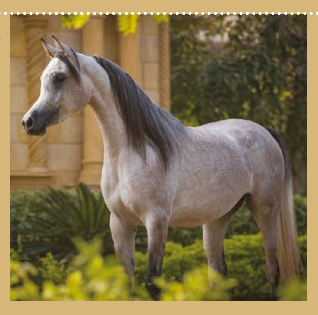
Halaa Al Baydaa (Jamil Al Rayyan x Gawaher Al Baydaa) Bred and owned by Al Baydaa stud, Egypt

part is that he has left us and we never had enough of him".