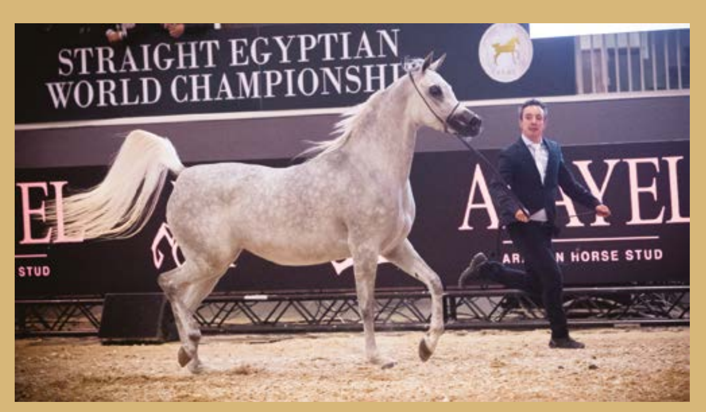
TB Fayza (Jamil Al Rayyan x TB Helwa), Gold Champion at the int. EE in Bergamo and Top Five at the SEWC in Milan 2019. Bred and owned by Tre Balzane Stud.