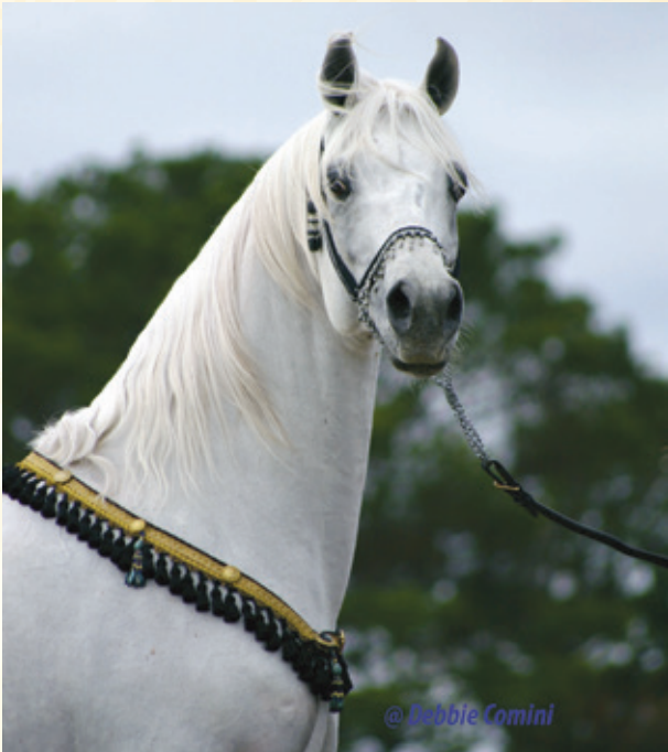
The eyes of a falcon hunting in the desert.

Hotep was unique among straight Egyptians in that country and was greatly admired for his majestic presence.