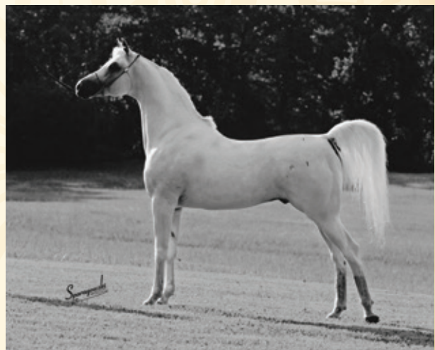
Ansata Iemhotep: Egyptian Event Supreme Champion in 2003, U.S. National Top Ten Futurity Colts