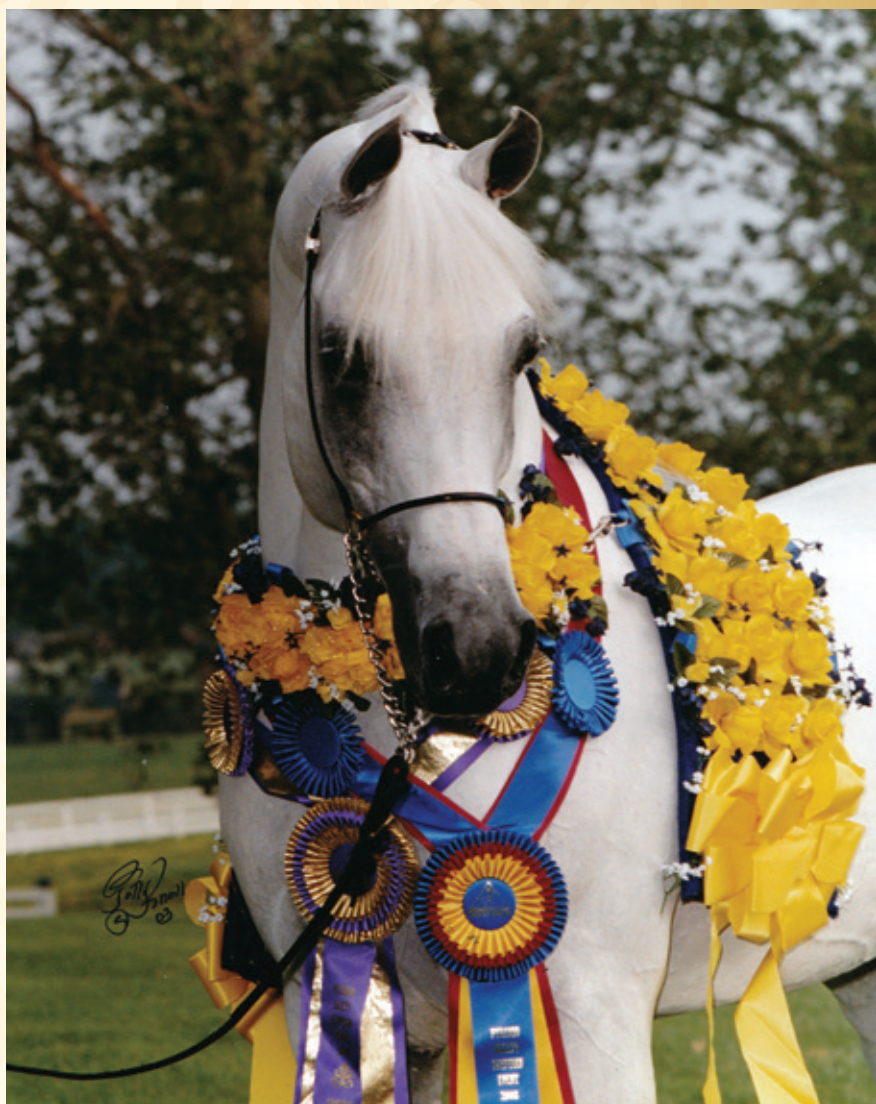
Hotep with all his ribbons after winning Supreme Champion Stallion at the Egyptian Event on Ansata's 45th anniversary.