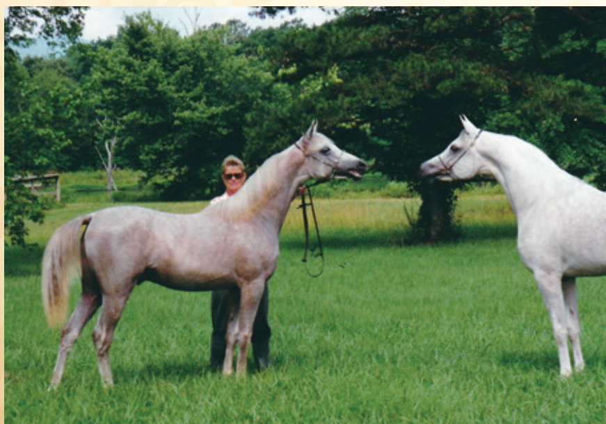
Ansata Iemhotep “clacking” at his older full brother Ansata Sinan .