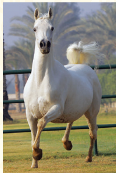
Ansata Nafisa shows the same elegant qualities as her brother Ansata Iemhotep . Owned by Sakr Arabians (Egypt).