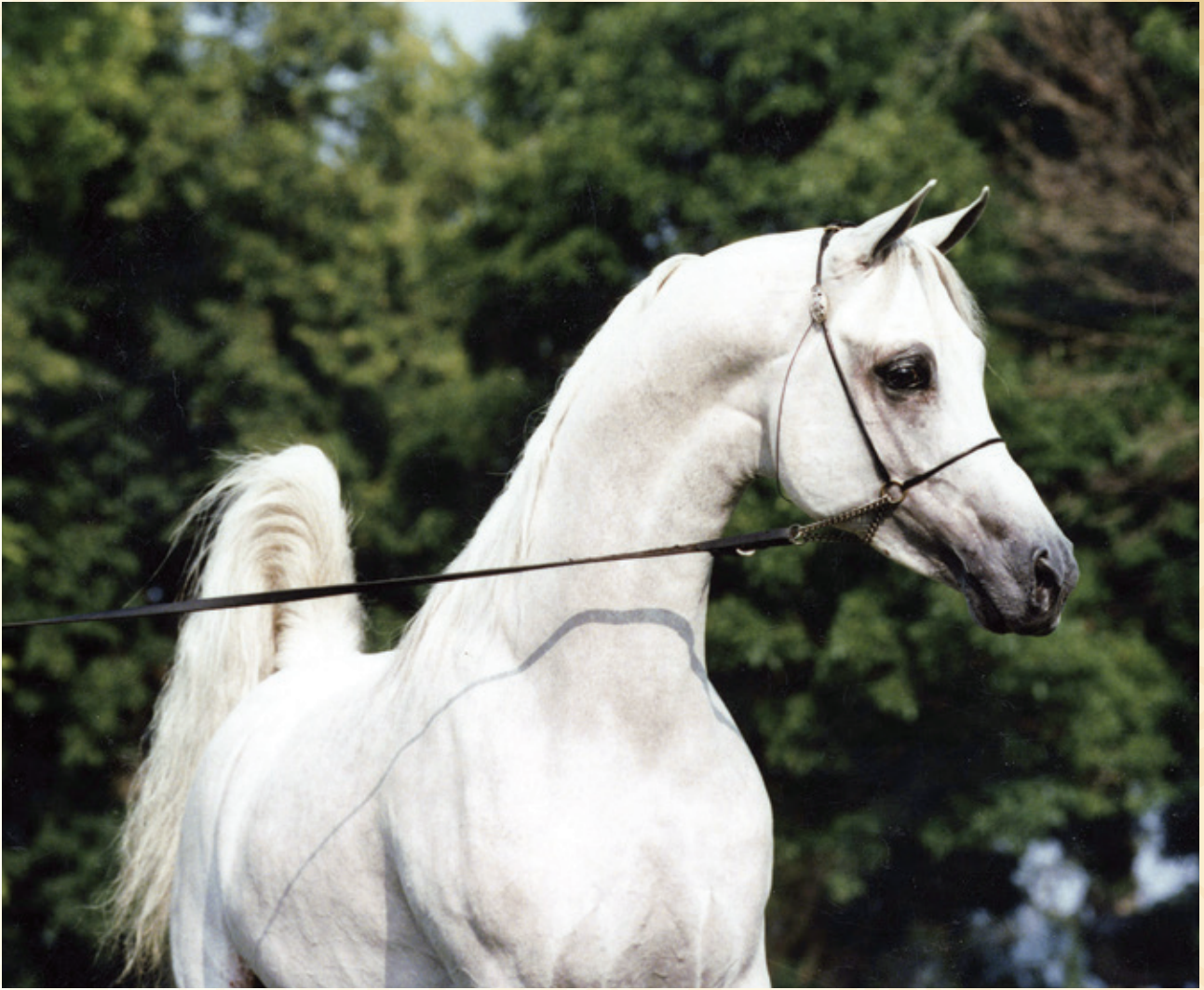
Ansata Iemhotep growing up.