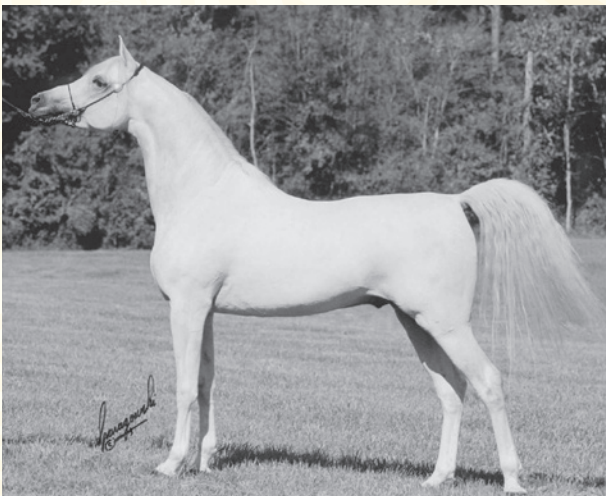
Ansata Sirius (Ansata lemhotep x Ansata Sekhmet, the full sister to Ansata Selket). The Body Beautiful! Photographed before he was exported to Kuwait, Bait Al Arab State Stud. Ansata Sirius broke a front ankle, but it mended and he went on to win a Top Ten at the Egyptian Event before he was sold to Kuwait.