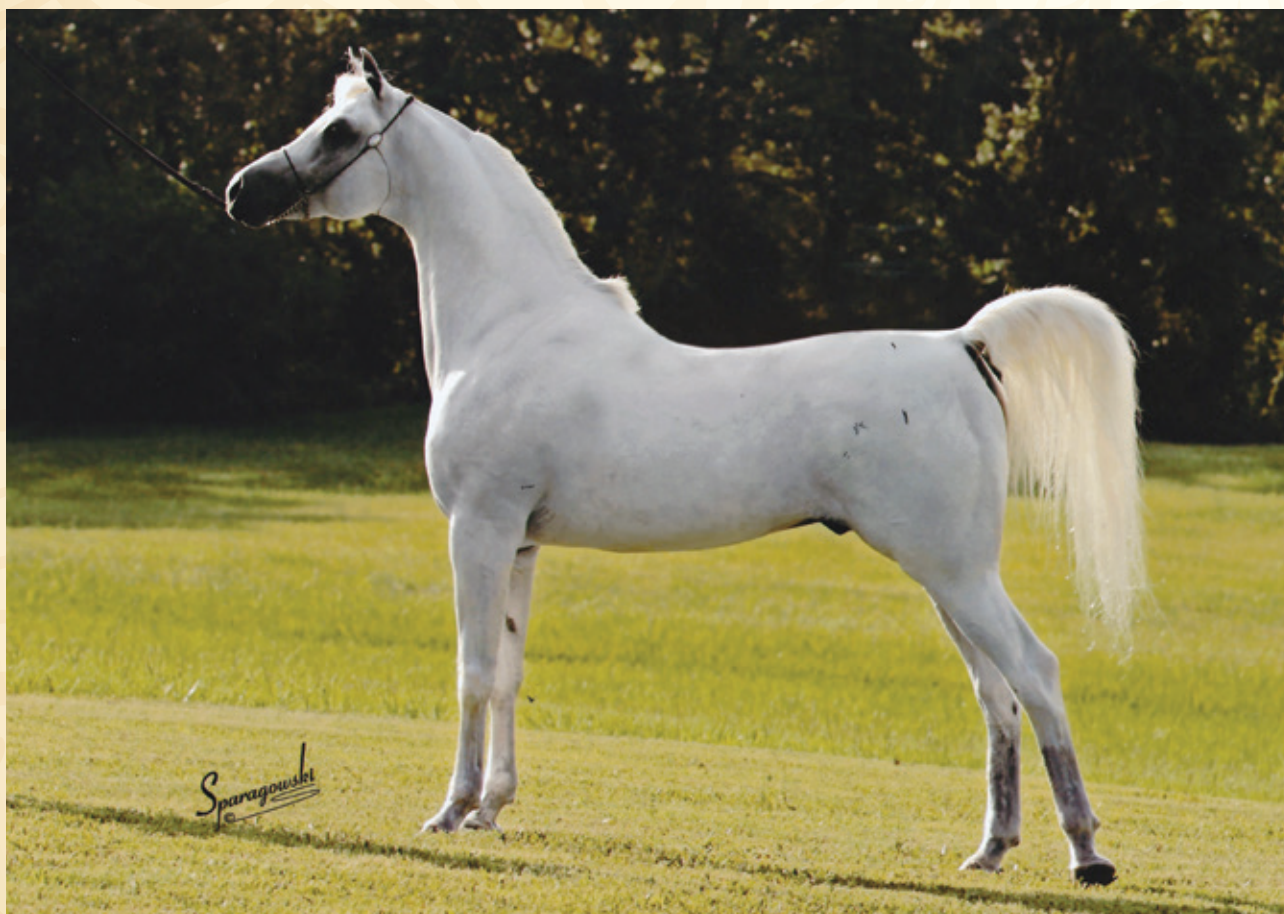
Ansata lemhoteep as a mature stallion at the Ansata stud in Mena, Arkansas. This photo perfectly displays his incredible overall balance and his ideal length of neck and mitbah. (The scars on his hind legs from being caught in a stall door still show.)

The moment Ansata Iemhotep stepped into the arena at the Kentucky Horse Park the whole public seemed hypnotized to admire him: he was not a real horse... Too beautiful, too perfect, the vision in white we all have of “ the dream horse .”