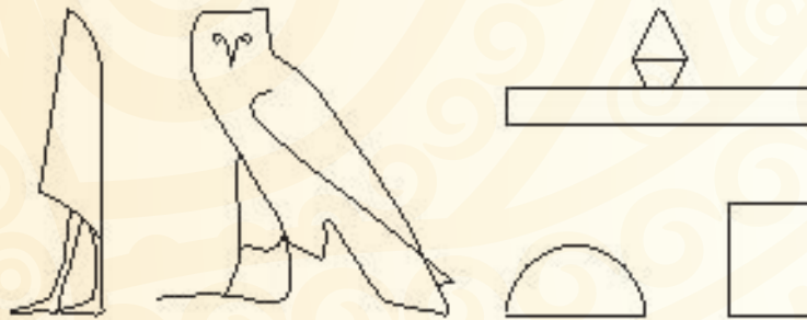
(Imhotep in Heiroglyphics)

IMHOTEP (2667 B.C. - 2648 B.C.) ANSATA IEMHOTEP (1993 A.C-2014 A.C.)