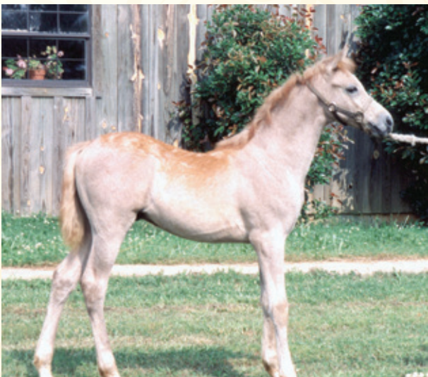
Ansata Iemhotep as a foal.

In the case of Ansata Iemhotep, we celebrated the achievement of what we hoped for.”