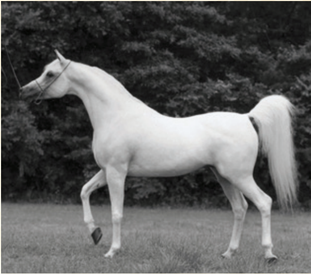
Ansata Halim Shah (Ansata Ibn Halima x Ansata Rosetta, by Ansata Shah Zaman), sire of Ansata Nefara, dam of Ansata Iemhotep.