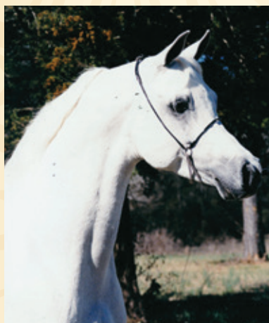
Ansata Sinan, an international champion.

Ansata Sinan and Ansata Iemhotep were superior individuals, yet different, and both were valuable sires in passing on their unique qualities. The third repeat mating resulted in a magnificent mare, Ansata Nafisa - much like Iemhotep in type, and she became a most successful broodmare for Sakr Arabians in Egypt. All three siblings became significant champions and superior breeding stock. Other interesting and valued examples of repeat matings were, (1) Ansata Abbas Pasha (1964) by Ansata Ibn Halima x Ansata Bint Mabrouka , and Ansata Ibn Sudan (1965); and (2) Ansata Omar Halim (1979) and Ansata Halim Shah ( Ansata Ibn Halima x Ansata Rosetta ) (1980). Once again, all the full siblings were different from each other, yet each individual had classic beauty and type in abundance, and all were show champions.