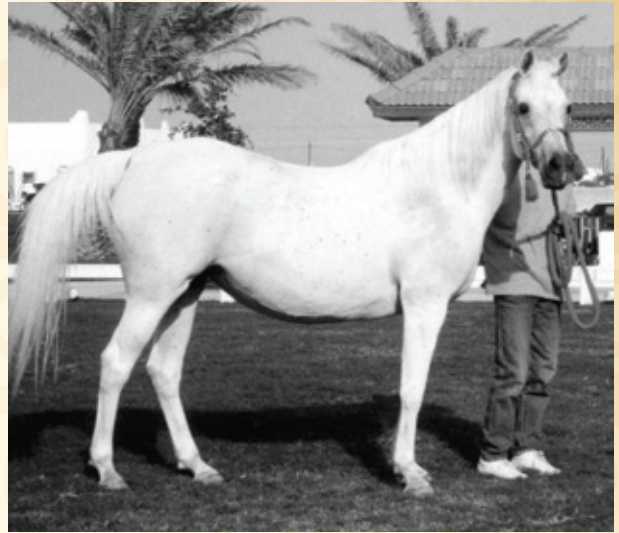
Ansata Sudarra (Ansata Abu Sudan x Ansata Delilah by Ansata Shah Zaman), grand dam of Ansata Iemhotep. at Al Shaqab in Doha, Qatar, where Sudarra spent her final days.