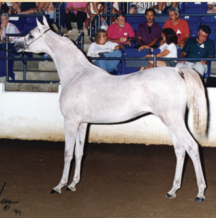
Ansata Iemhotep winning his yearling class at the Egyptian Event 1994.