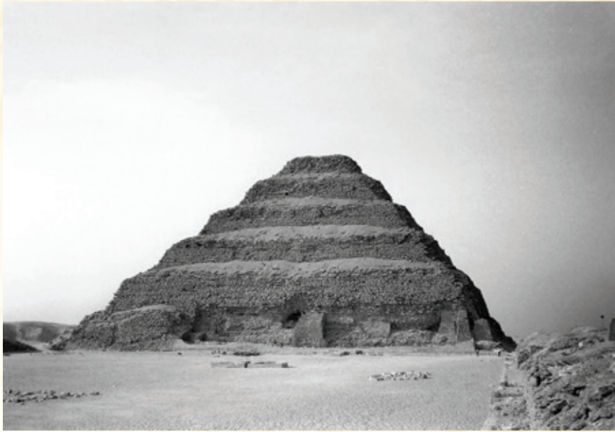
Step Pyramid at Saqqara (Egypt). One of the most brilliant architecture wonders of the ancient world. It is recognized as the first monumental stone structure.

like him! Both have inspired generations for more than 4700 years.”