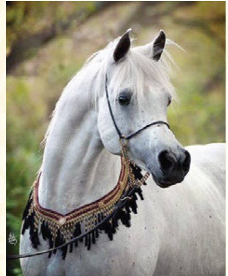
Ansata Nile Pharaoh, champion son of Ansata Imhotep, at Rhodium Stud in New Zealand. On lease for 2014 to Ariela Arabians, Israel.