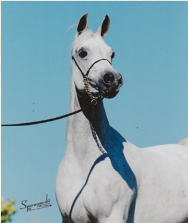
Ansata Serqit (Ansata lemhotep x Ansata Selket by Ansata Halim Shah). One of the most influential lemhotep daughters. Photographed at Ansata before she was exported to Germany and then to Kuwait.