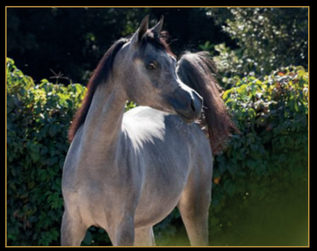
PALERMO AT Naseem Al Rashediah