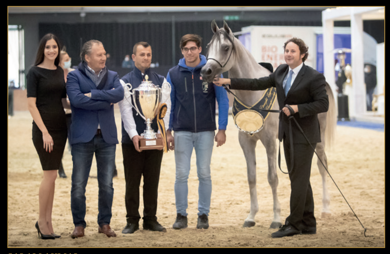
SALAM AKMAL Naseem Al Rashediah | Salmma BKV. Bred & owned by Akmal Stud Gold Medal Champion Yearling Colts - SEWC 2020

triumph at the SE World Championships, he proved that he can compete with non-SE Arabians too and achieve amazing success. At the 2017 Menton show, Naseem again stood on the podium as a Silver Junior Champion Colt. However, it was his most recent win during the 2020 Straight Egyptian World Championships in Milan that established him as a showring phenomenon. With a spectacular score of 93.88 points, including maximum notes for type, head and neck and 2x20 for movement, Naseem remained undefeated throughout the whole show. Not only did he become unanimous Gold Champion Stallion,