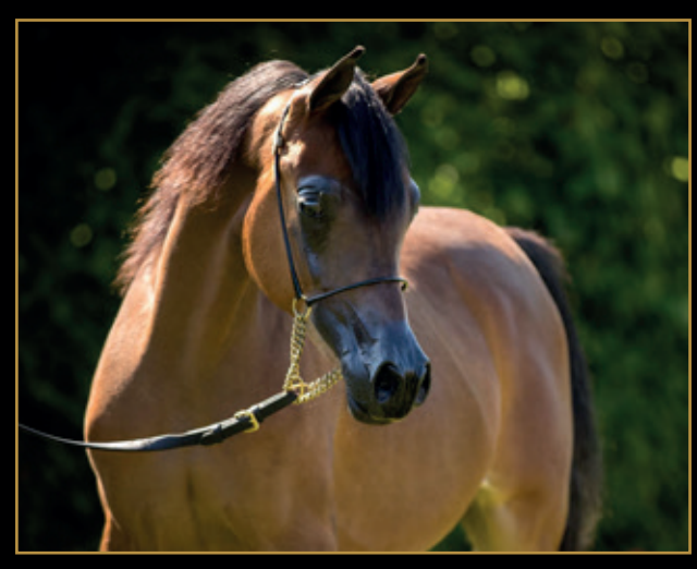
GJ AMIRA DEENAA Naseem Al Rashediah | Pashmina