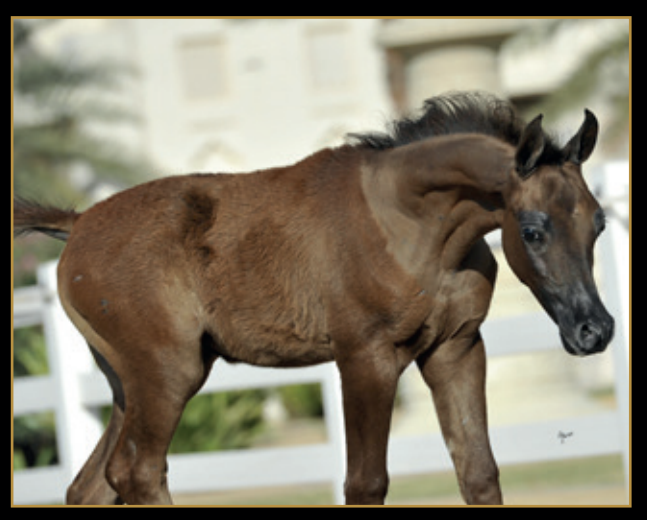
AMIRAL AL RASHEDIAH Naseem Al Rashediah | Moniet Al Rashediah