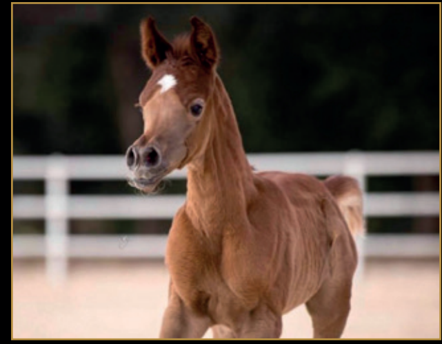
Naseem Al Rashediah | Al Jazi Al Nasser filly bred and owned by Al Nasser Stud