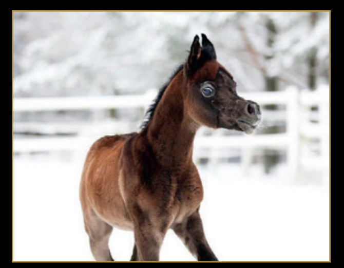
NAHALA O Naseem Al Rashediah | Nowara S Glam. Bred by Sweden Arabian Stud