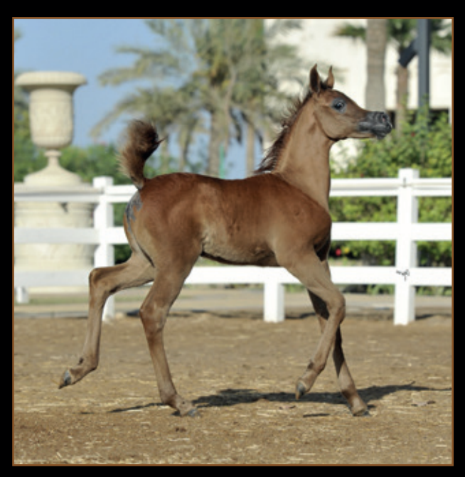
HIYAM AL RASHEDIAH Naseem Al Rashediah | Hala Al Rashediah