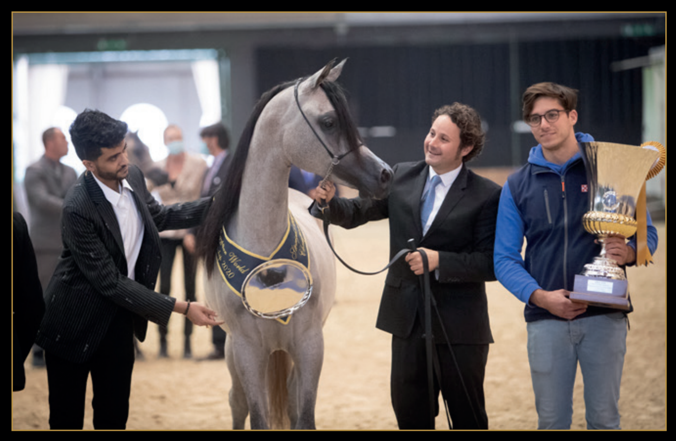
AYAH AL FALA Naseem Al Rashediah | Zumorroda Al Waab. Bred & owned by Al Fala Stud Gold Medal Champion Yearling Fillies - SEWC 2020

are considered the cornerstones of the breed as well as Nazeer's most prominent sons, appear in Naseem's pedigree six and nine times respectively. With all the unpredictability of breeding, such a concentration of priceless genes must have resulted in a superior individual. The excellence of Saklawi I sire line in Naseem's genotype and phenotype is further enhanced by his exceptional dam, the reigning queen of the Al Rashediah Stud - Nabaweyyah Ezzain. This priceless pearl of Bahrain once again confirmed her value as a broodmare during the 2020 Straight Egyptian World Championships, where Naseem's maternal half-