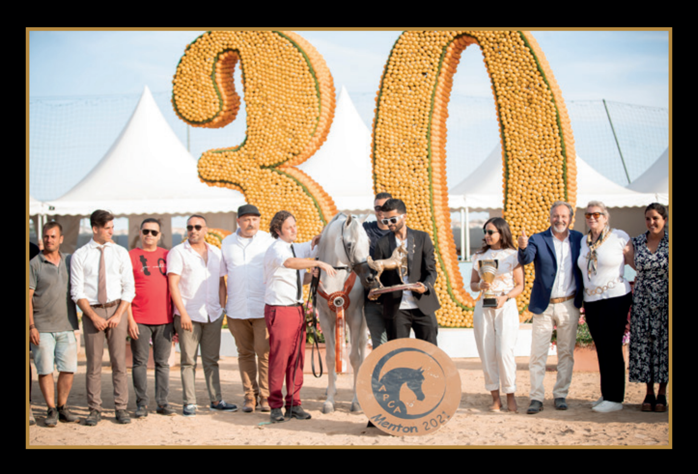
CHAPTER 2 Text by Giorgia Mauri ■ photos by Al Rashediah Stud archive The value is proven.