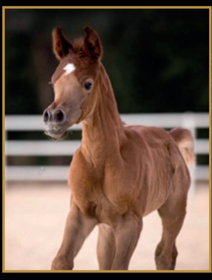
Naseem Al Rashediah | Al Jazi Al Nasser filly bred and owned by Al Nasser Stud