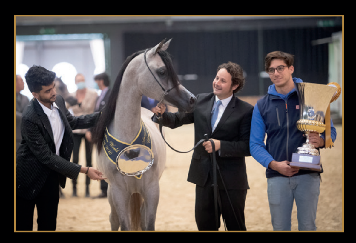
AYAH AL FALA Naseem Al Rashediah | Zumorroda Al Waab. Bred & owned by Al Fala Stud Gold Medal Champion Yearling Fillies, SEWC 2020