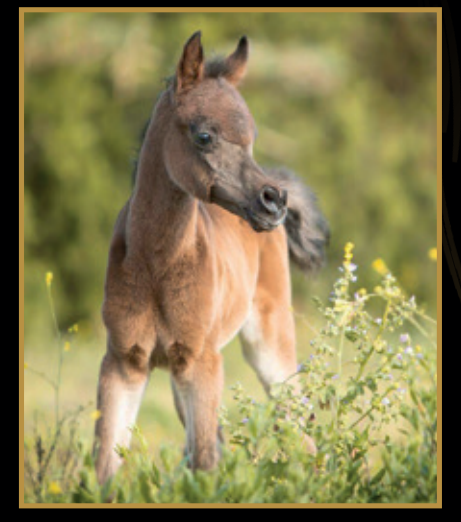
RAZAN AL JOOD Naseem Al Rashediah | FH Sharuby Rose 2021 bay Straight Egyptian filly