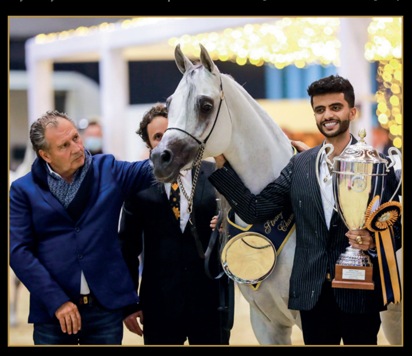
Unanimous Golden SEWC Stallion: 2020 Champion Stallion

Just one look at Naseem's impressive pedigree is enough to understand where his classic Arabian type and distinct desert beauty come from. Without a doubt, his greatness stems from the concentration of legendary individuals in his bloodlines as well as the genetic diversity of his sire and dam. Being a direct descendant of the legendary