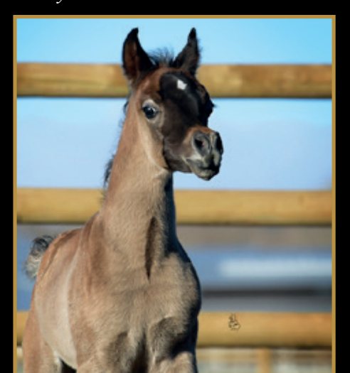
Naseem Al Rashediah | Naillla De Bloostone 2021 grey purebred Arabian colt bred by Orrion Farm