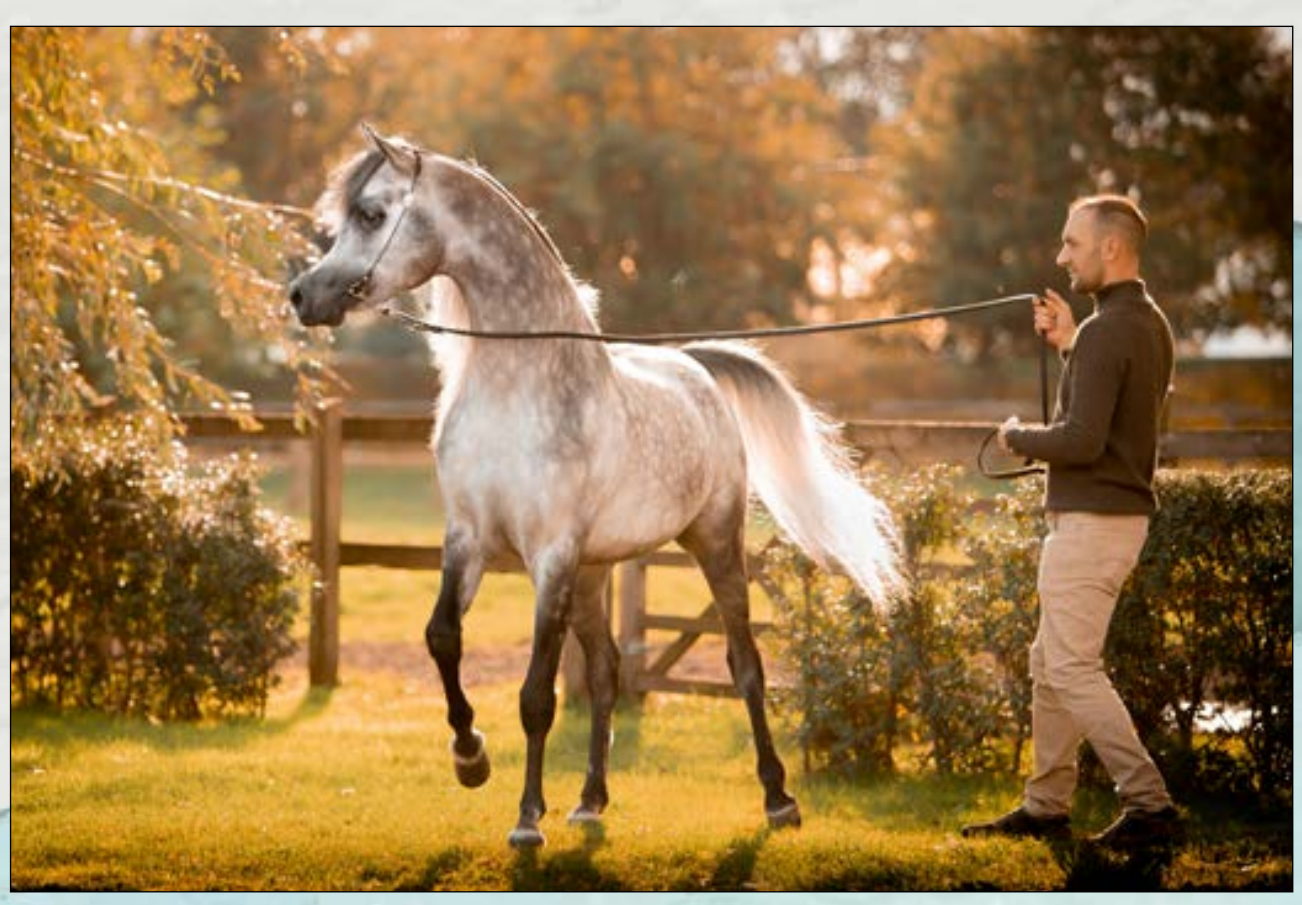
2019 World Champion Junior Colt EKS Farajj. Strongly linebred to Laheeb.