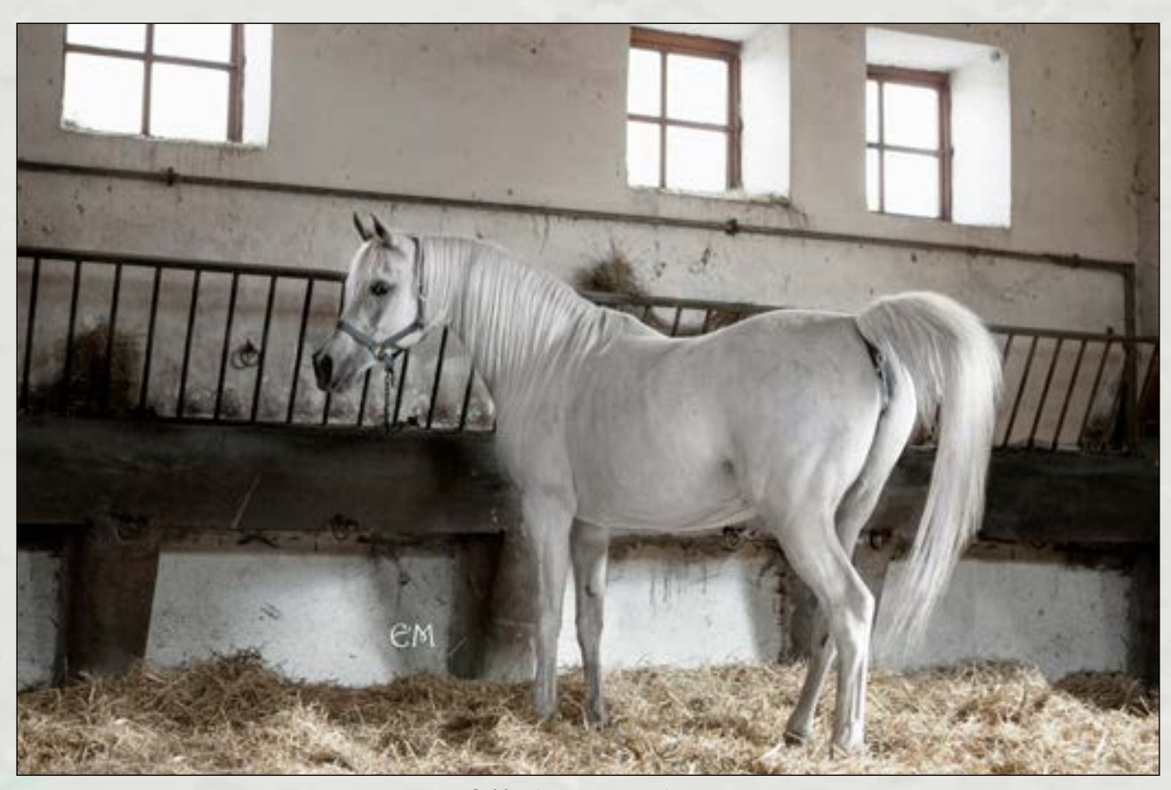
2005 Polish National Champion and World Champion Mare. Galilea (Laheeb x Georgia).