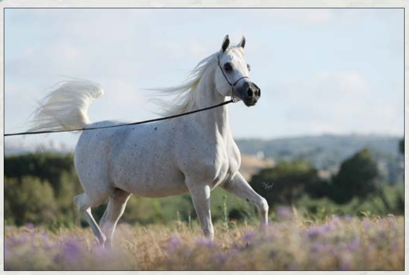
Multi Champion Mare Dafina AA (Al Bilal x Dumka by Laheeb).