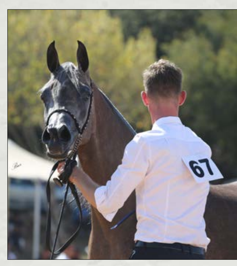
Multi Champion Mare Salsabil AA (Laheeb x Saniyyah RCA).