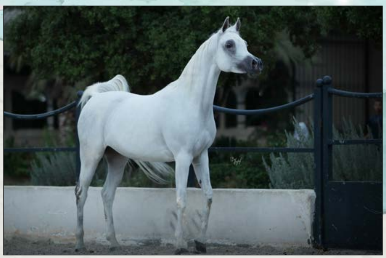
One of the most important Laheeb daughters at Ariela Arabians, Safiyyah ^{AA} (Laheeb x Saniyyah RCA). Five of her daughters have been retained for the Ariela program.