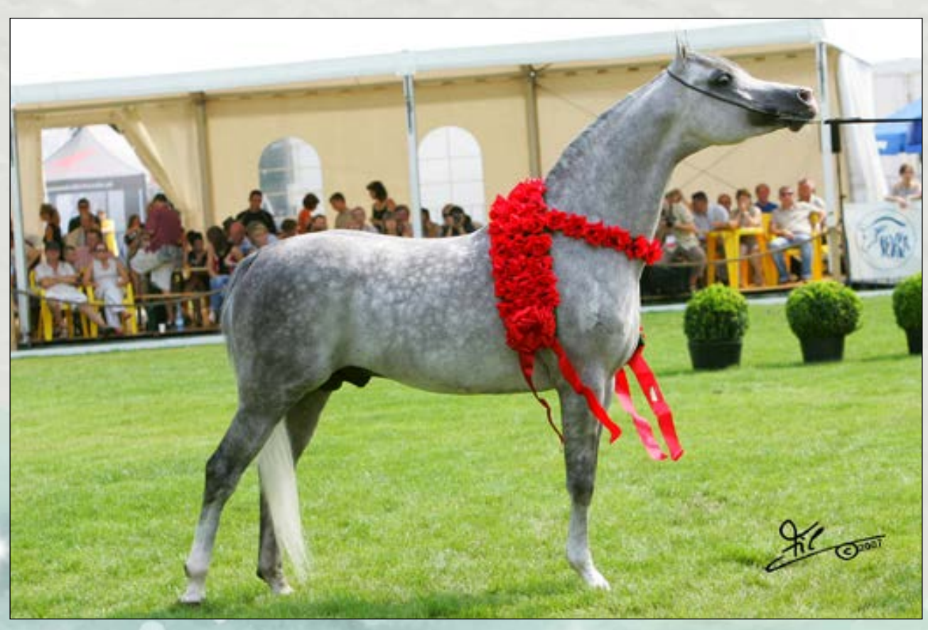
Multi Champion Stallion and Polish National Champion Poganin (Laheeb x Pohulanka).