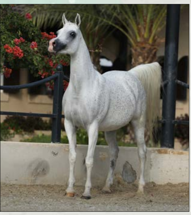
Badriyah AA (Nader Al Jamal x Baraaqa AA by Laheeb).