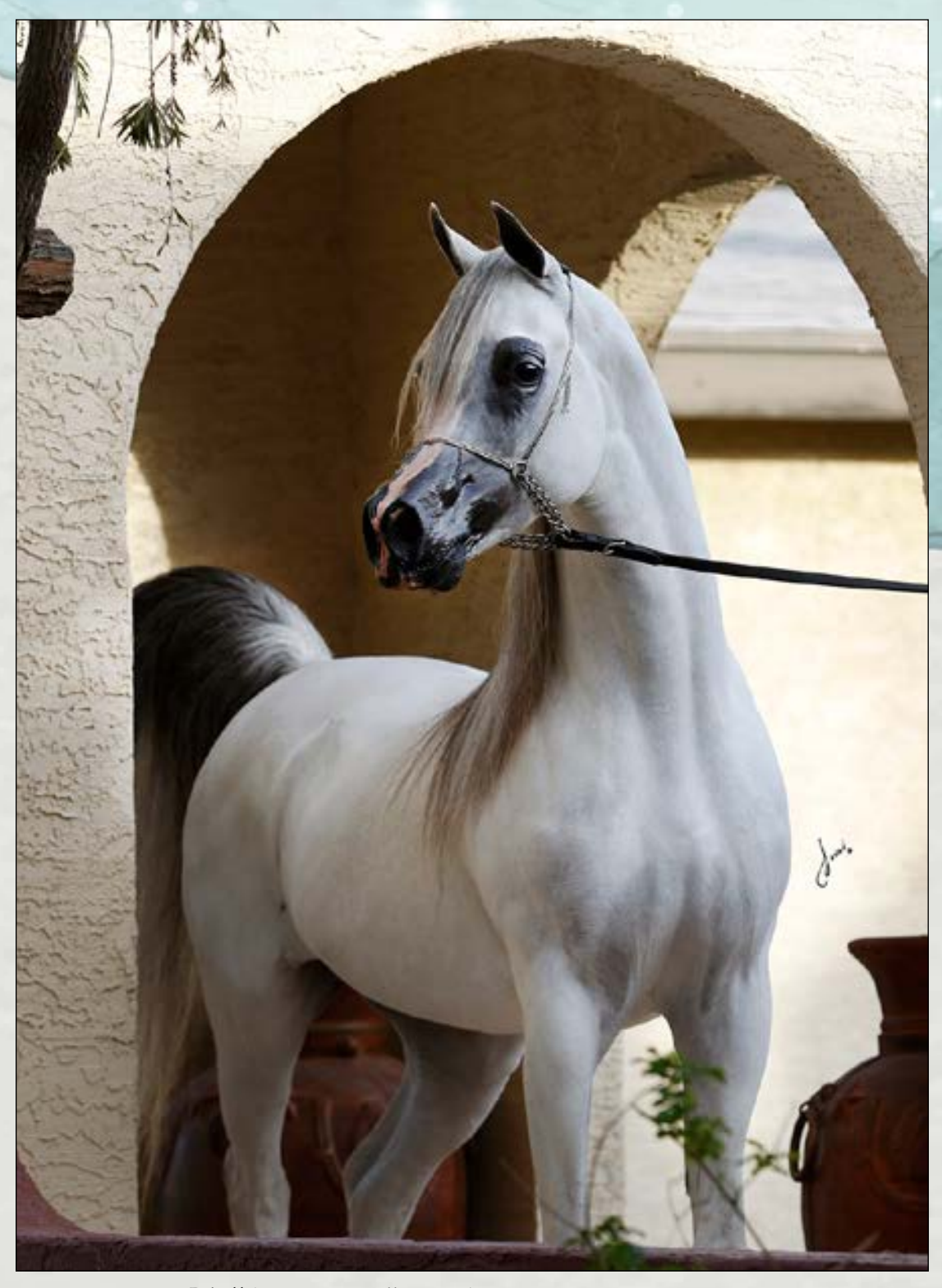
Multi Champion Stallion {f Baha}^{\,{ m AA}}(Al\,Ayad\,x\,Baraaqa^{\,{\cal AA}}\,by\,Laheeb).