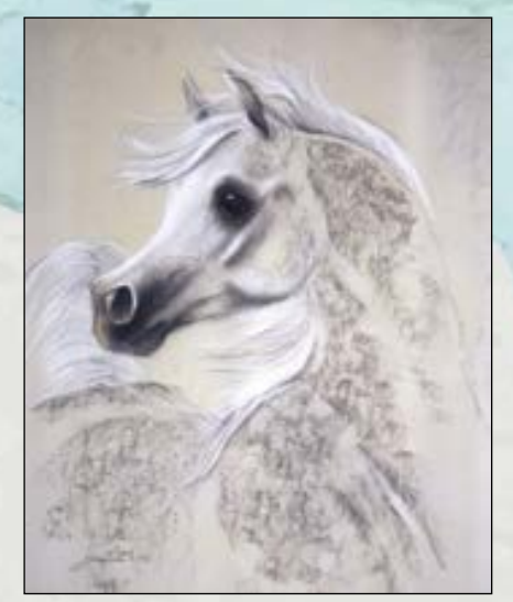
Laheeb's paiting from Poland