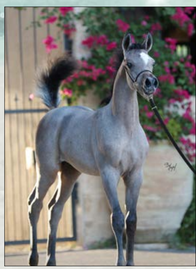
Sanaa AA (Al Ayal AA x Safiyyah AA by Laheeb).