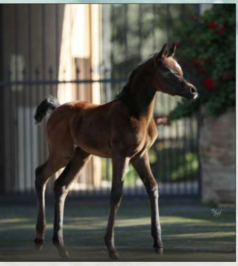
Sara AA (Emerald J x Safiyyah AA by Laheeb).