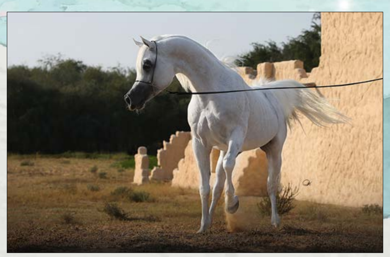
Multi Champion and 2006 World Champion Stallion Al Lahab (Laheeb x The Vision HG).