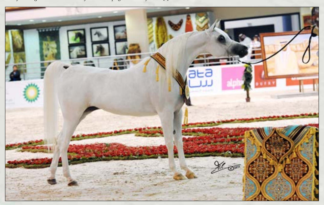
Badawiyeh AA (Laheeb x Bahiha) Multi-Champion Mare and 2014 Silver World Champion Mare.