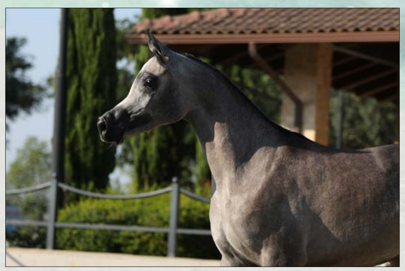
Bahiya AA (Kenz Al Baydaa x Balqis AA by Laheeb).