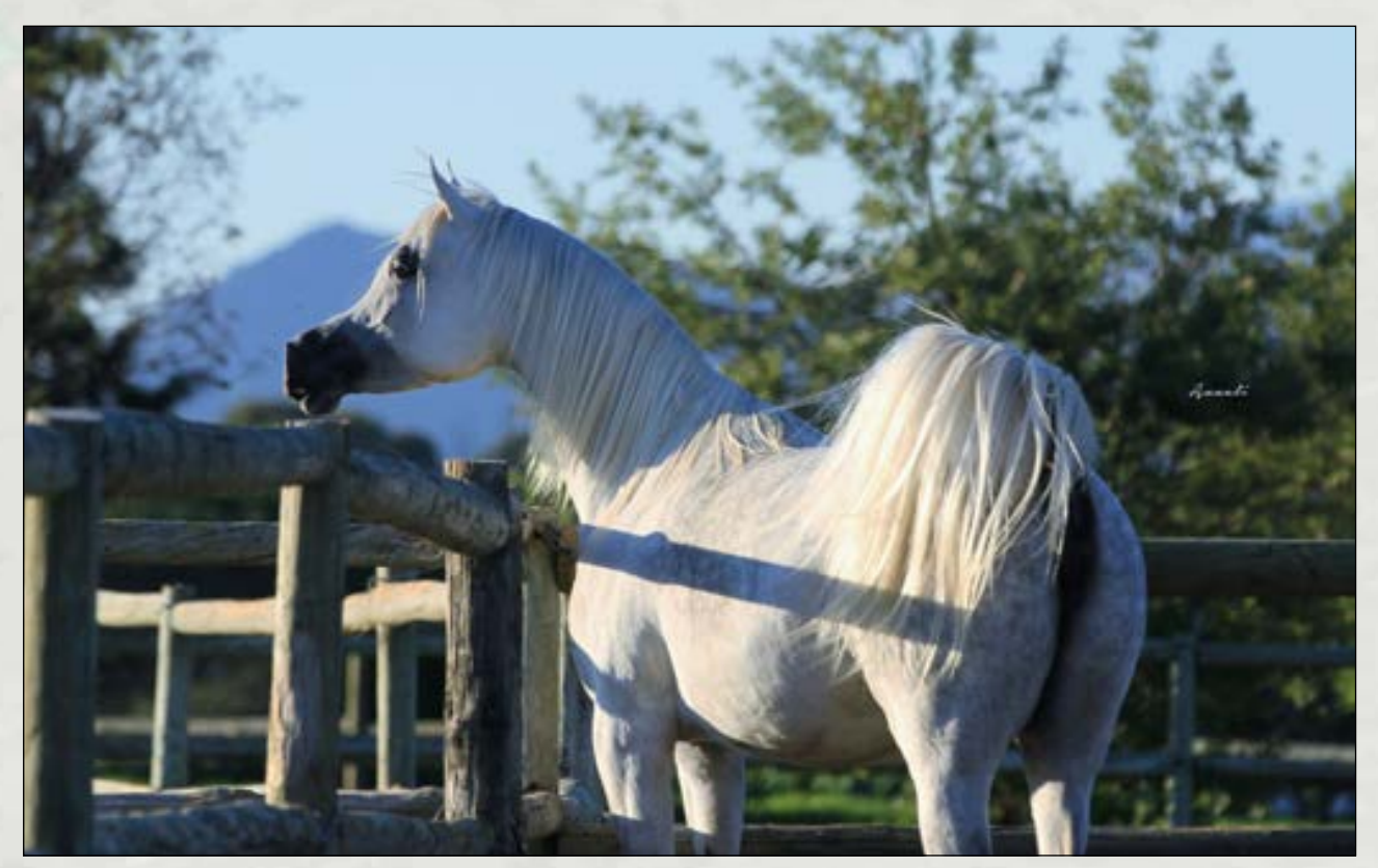
EKS Bint Helwah (Laheeb x Bint Helwah A (Al Ayad x Al Halah by Laheeb) Dam of World Champion EKS Farajj.