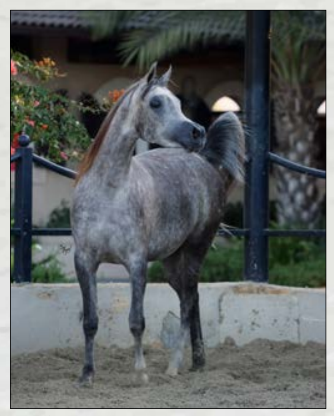
Sinaya AA (Frasera Mashar x Safiyyah AA by Laheeb).