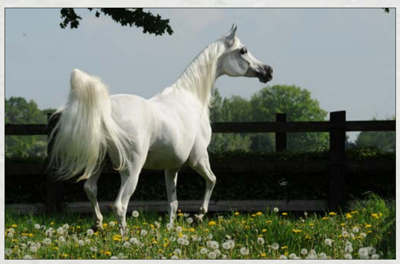
\textit{Multi-Champion and 2014 Bronze World Champion Mare} \ \textbf{Emira} \ (\textit{Laheeb x Embra}). \ \textit{Photo by Elisa Grassi}