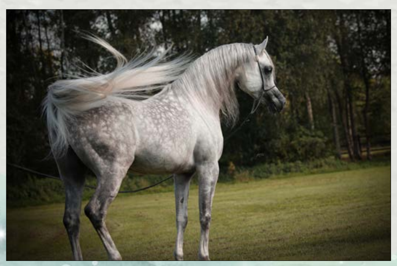
Reserve Champion Colt at the Israeli Egyptian Event, Al Wahab AA (Laheeb x The Vision HG).