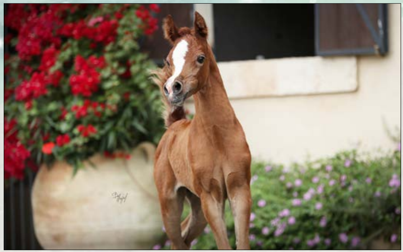
Nasmah <sup>AA</sup> (Moaiz Al Baydaa x Nefertiti <sup>AA</sup> by Laheeb).