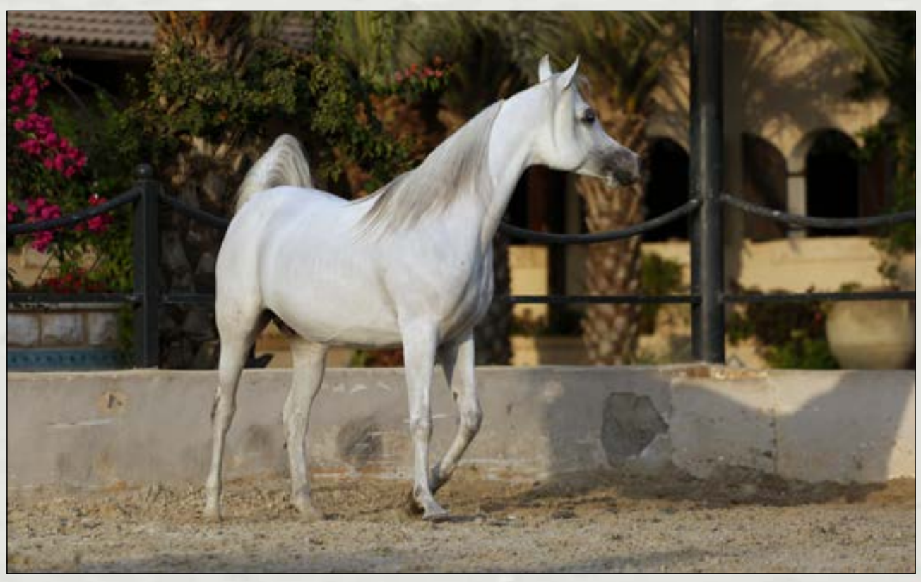
Multi Champion Mare Basmah AA (Laheeb x Al Baraqai AA).