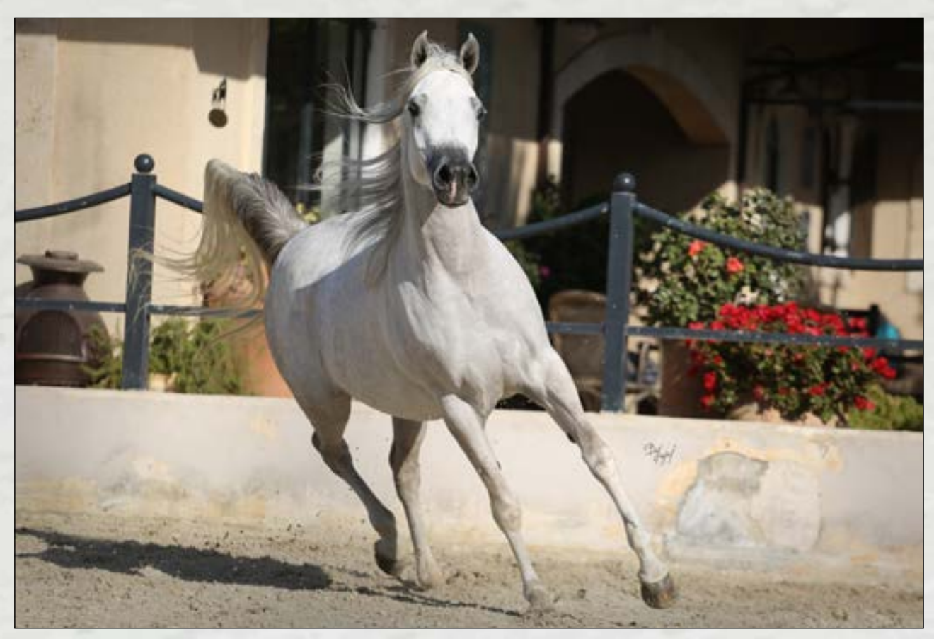
Nefertiti AA (Laheeb x Nashwah AA).