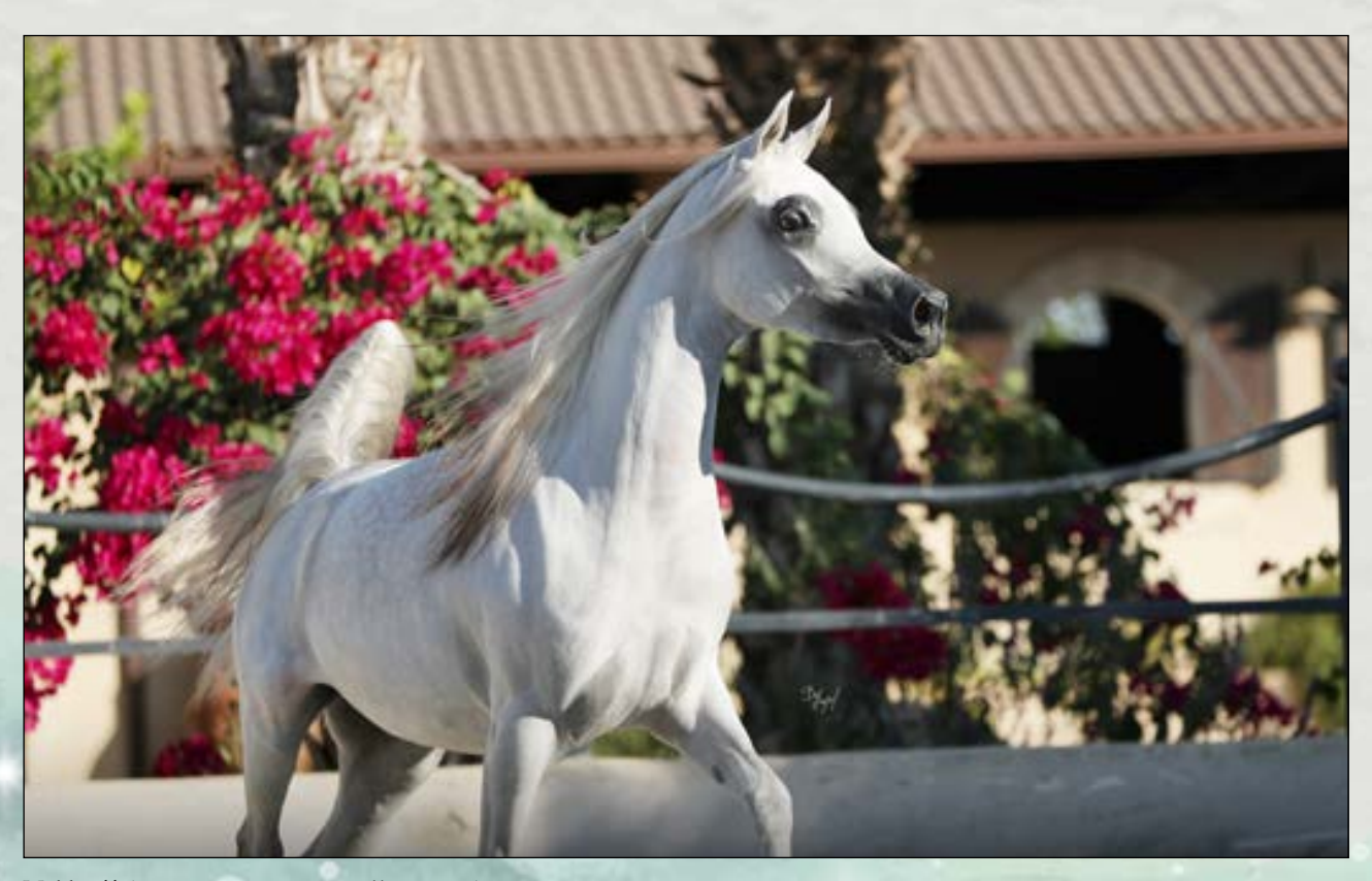
Malikat AA (Kenz Al Baydaa x Malikah AA by Laheeb).