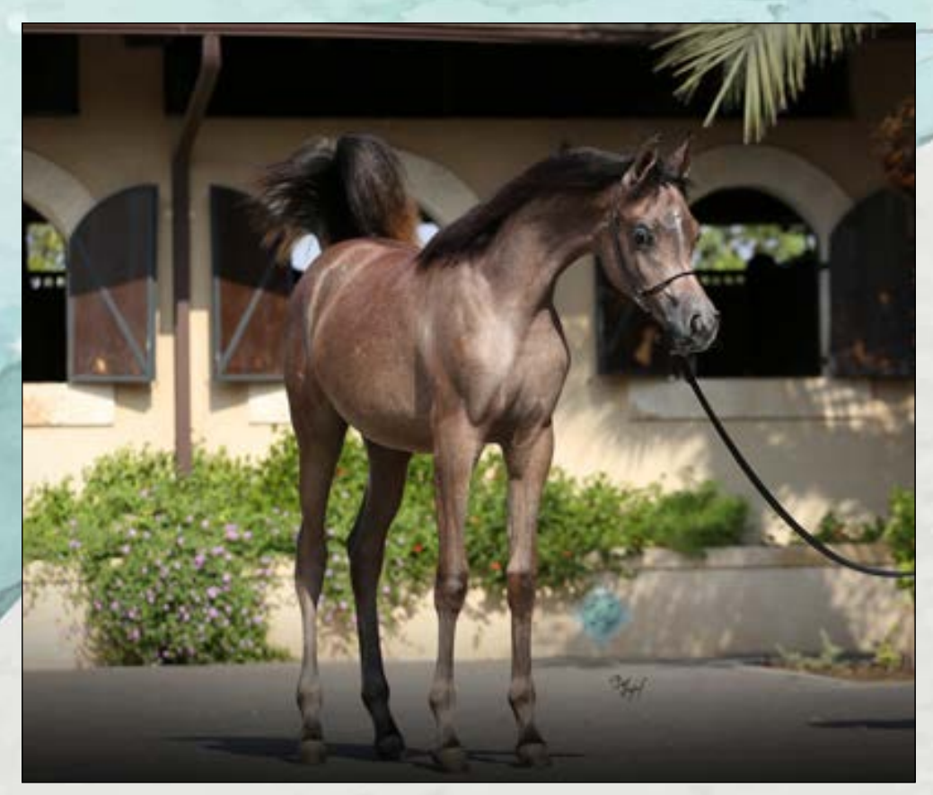
Sarai ^{AA} (Jyar Meia Lua x Safiyyah ^{AA} by Laheeb).