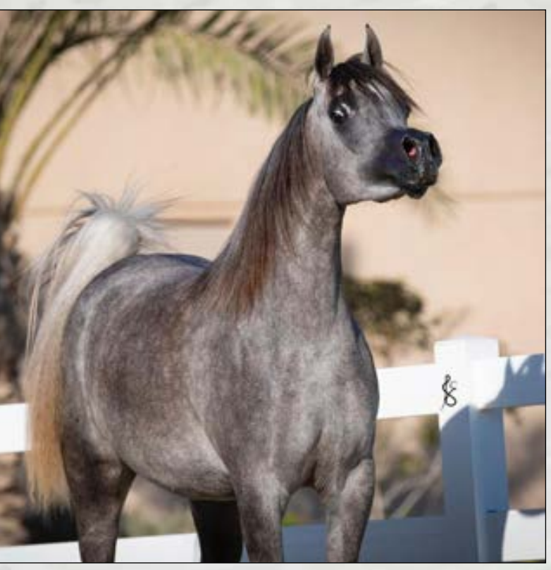
2018 Gold Champion Yearling Filly at the All Nationals Cup International Egyptian Event in Kuwait, Bosmat AA (Frasera Mashar x Basmah AA by Laheeh)