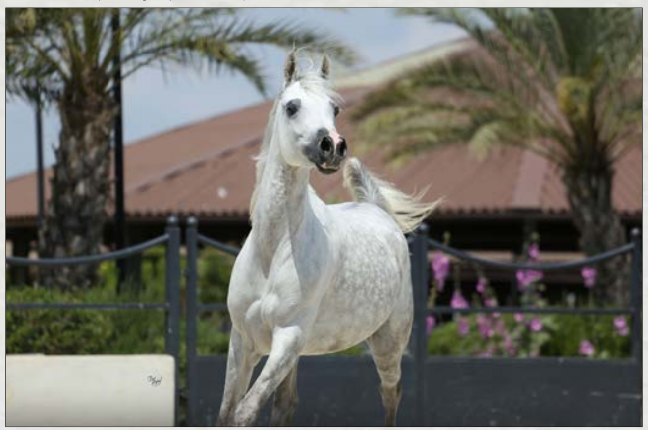
Balqis AA (Laheeb x Al Baraqai AA).