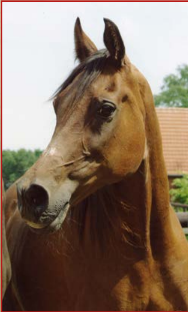
El Thay Maheera, born 1981, by Nizam x Mona II by Mahomed and Mahiba – full sister to Mofisa representing the Saglawi Jedran Strain – Moniet El Nefous at El Thayeba