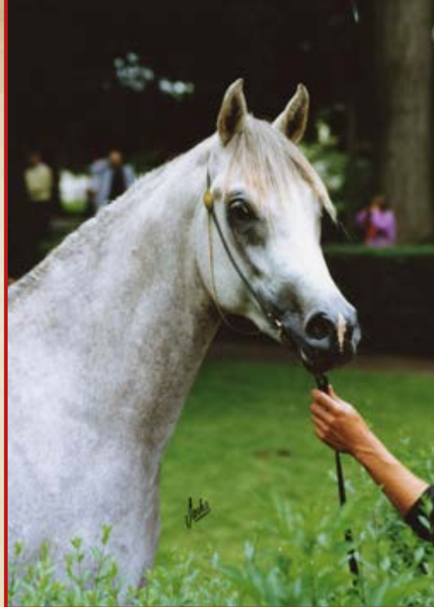
El Thay Shah Mabrouk, born 1990, by El Thay Ibn Halim Shah x Mahameh by Ibrahim, a full brother to Mona II and El Thay Maheera out of Mona II. He was awarded multi times Champion and later sold to Chile