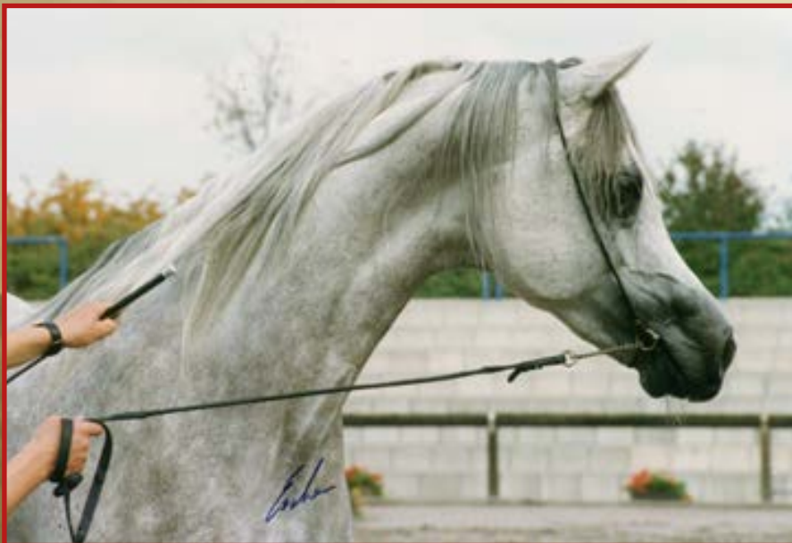
El Thay Mansour, born 1986, by Ansata Halim Shah and El Thay Maheera by Nizam and Mona II - full brother to El Thay Maheer