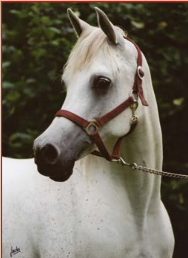
El Thay Bint Kamla by El Thay Mansour who is by Ansata Halim Shah and El Thay Maheera - Mona II. She is a representative of the Dahman Shahwan (El Dahma) - Moheba II - Kamla II family at El Thayeba and influenced by Mahiba