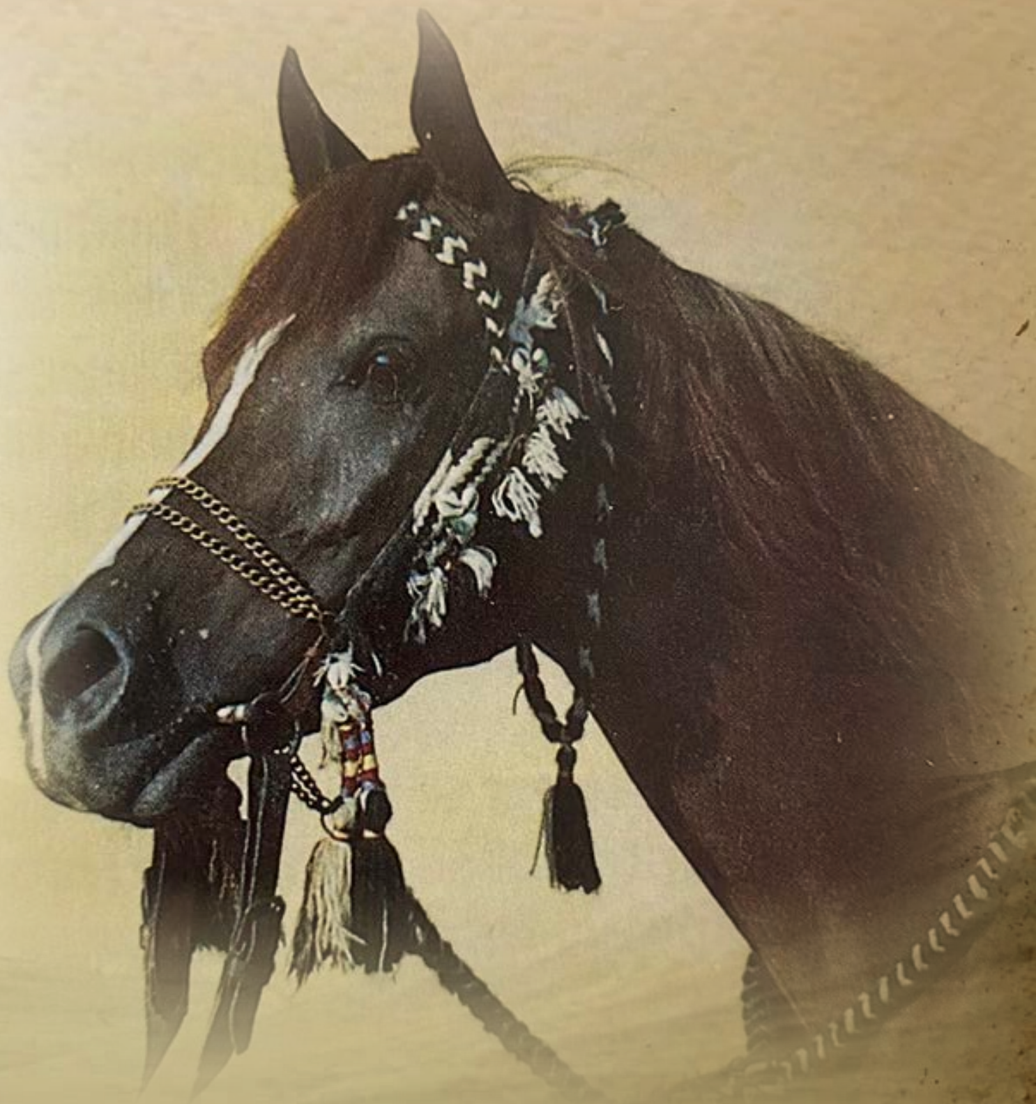
Mahiba, born 1966, by Alaa El Din x Mouna by Sid Abouhom and Moniet El Nefous, bred by El Zahraa, Egypt