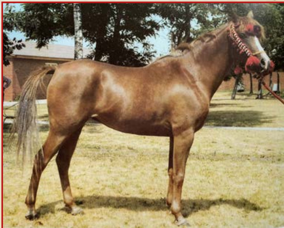
Kis Mahiba, born 1970, by Ibn Galal x Mahiba by Alaa El Din and Mouna, bred by the Hungarian State Stud Babolna - she is a half sister to Mona II