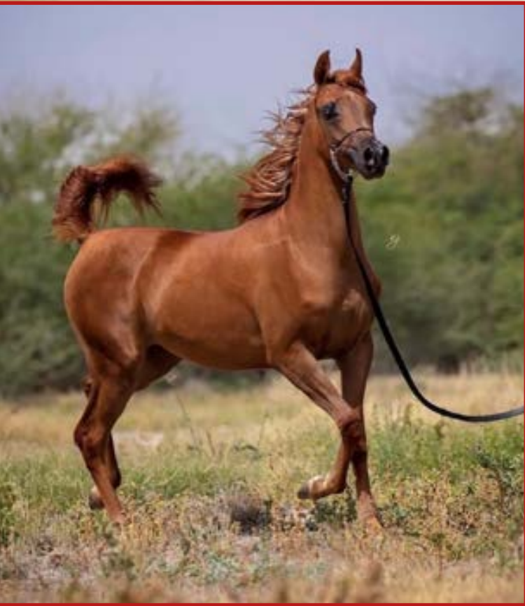
NK Lara, born 2021, by NK Nabhan x NK Lina by Kamar El Dine x Muneera Al Ariba - to Kis Mahiba, bred by Nagel's Katharinenhof Stud, owned by Doha Stud, Qatar - she is a sister in blood to NK Laziz

Today there is only one horse at El Thayeba that doesn't descend from the Mahiba family. Most of them trace to her two or more times, through both Mona II and her full brother Ibrahim. Now Laziz is growing up at El Thayeba, and the future has never looked more exciting. The lines of Kis Mahiba and Mona II may soon be joining to create the next thrilling chapter in the story of the little mare with the kind eyes, who only had four foals, but became an icon of the breed. □