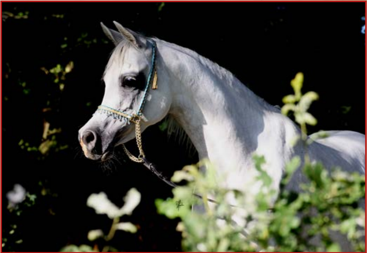
El Thay Toya, born 2009, by El Thay Mahfouz x El Thay Taqiyah who is double El Thay Mansour, a son of El Thay Maheera in her dam line. She represents the influence of Mona II - Mahiba in the Hadban Enzahi Strain - Taghreed - Yosreia family at El Thayeba Arabians