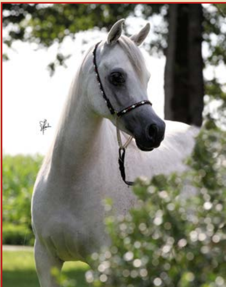
El Thay Kateefa Al Sabah (El Thay Mahfouz x El Thay Khadija by El Thay Mashour who is out of El Thay Bint Kamla - El Thay Mansour - El Thay Maheera - Mona II