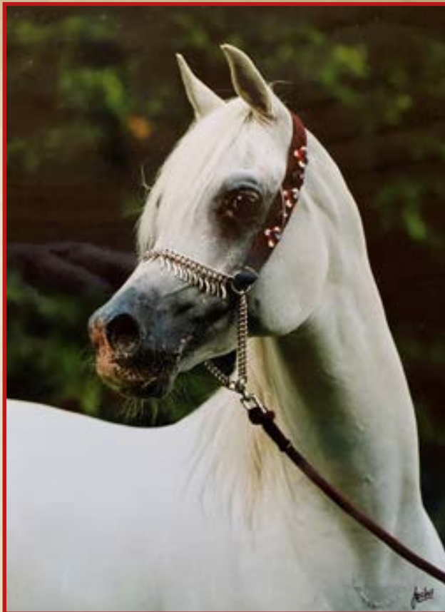
El Thay Mashour, born 1990, by Madkour I x El Thay Bint Kamla by El Thay Mansour who is out of El Thay Maheera - Mona II. With the exception of El Thay Kamria he can be found in the pedigrees of all horses of the Dahman Shahwan Strain - Moheba II and Malikah family at El Thayeba