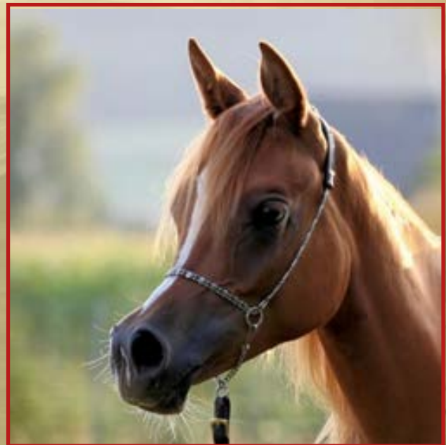
Moniet Al Ryah, born 2018, by Nader Halim x Madeenah Al Ryah by Farees Halim x Maheebah Al Ryah. She goes back to the daughters of Mona II which are Madinah and Mofisa as well as to Kis Mahiba, half sister to Mona II - influenced by the breeding programs of Ponnath Arabians and Tameri Arabians - a new addition to E Thayeba