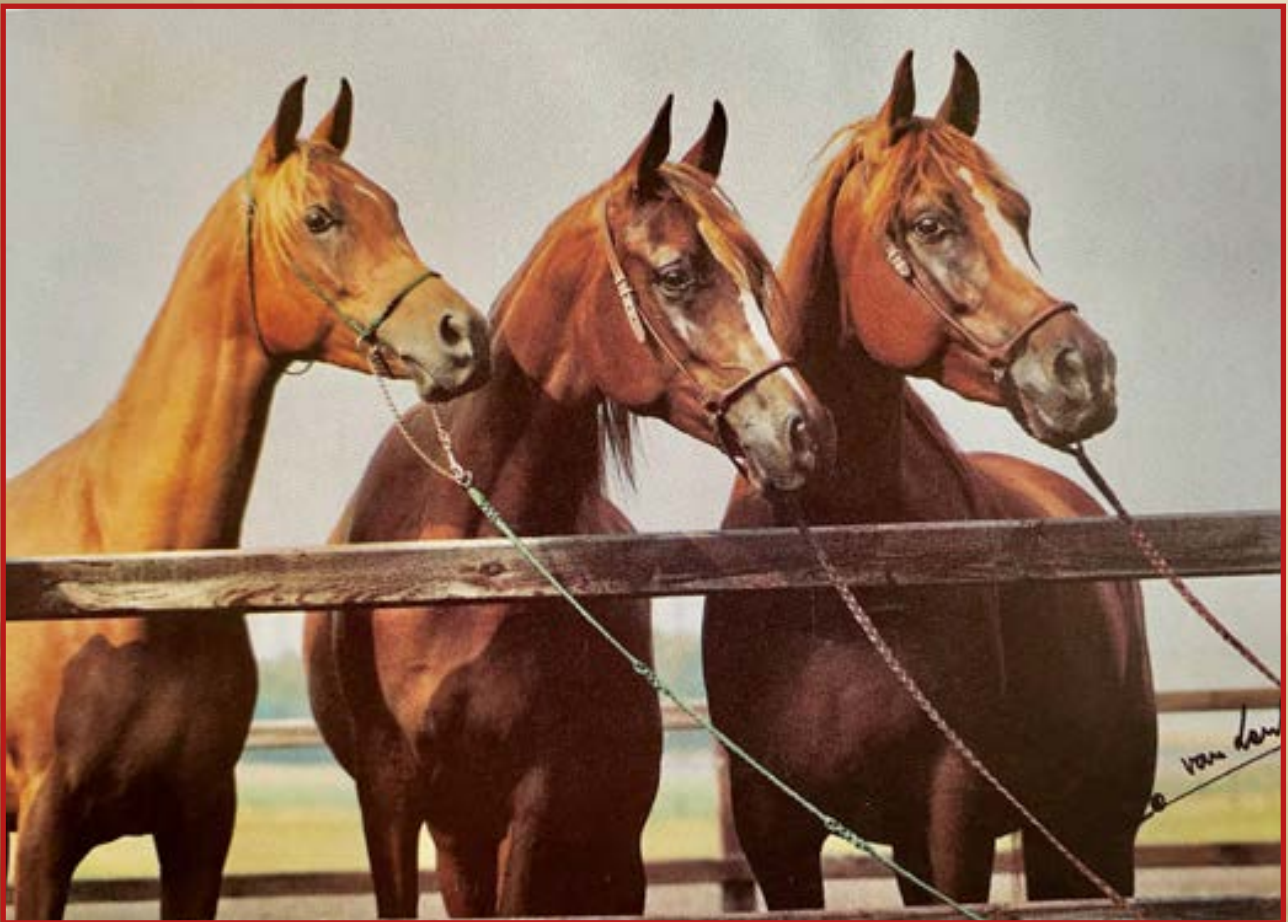
Mahiba (right), with her daughters Kis Mahiba (middle) and Sabah (left), both by Ibn Galal

who was World Junior Champion in 1985. Her son by Mohafez, Sameer, was not a show champion, but did well as a sire and has international descendants, especially through his black son DF Siraj. Sabah's Jamil daughter Sehnab established her own family. Sabah's dam line also continues at other stud farms through her daughters Shahwana (by El Moniet) and Salua III (by Mohafez), Mahiba's next two foals were sired by Mahomed (Hadban Enzahi x Malikah). The first was a colt named Ibrahim. Bearing a striking resemblance to his sire, Ibrahim became a well-known and popular breeding stallion in Germany at the El Shams Stud, siring numerous sons and daughters and gaining the title "Elite". Among his outstanding daughters were