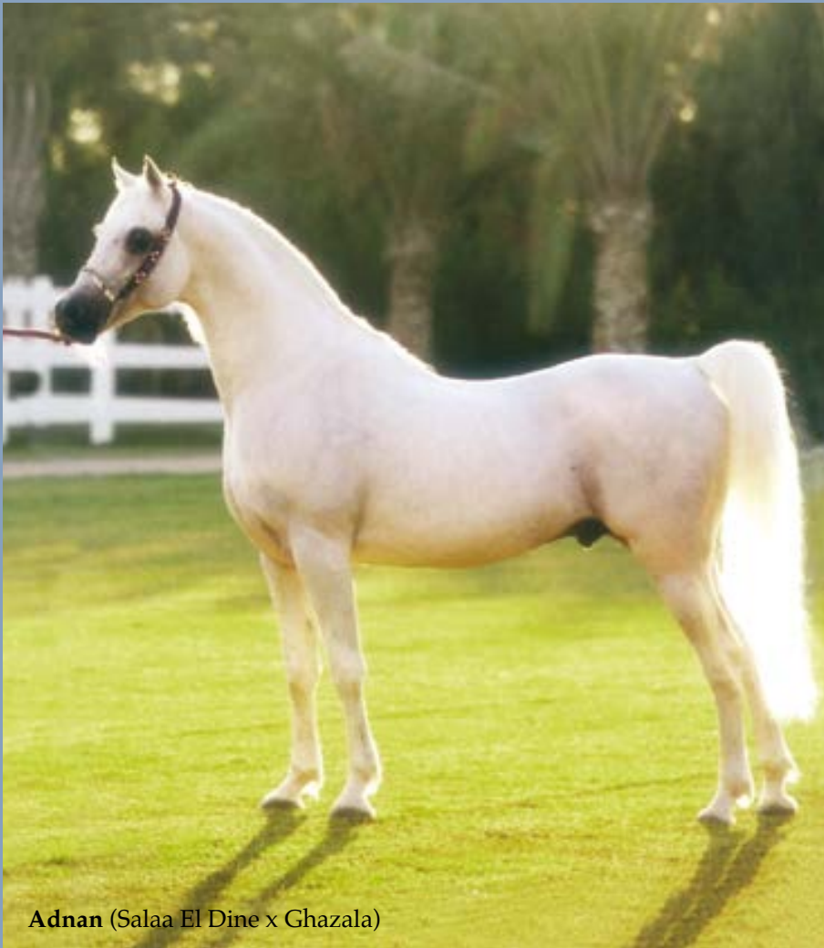
Adnan (Salaa El Dine x Ghazala)