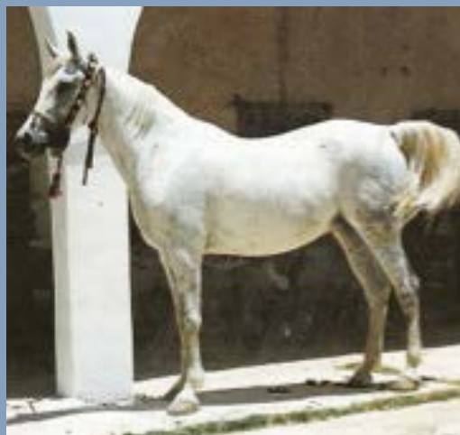
Syrian Arabians as presented to the WAHO committee.

The first surprise happened in the 60ies, when my work as one of the very early European experts in modern poultry breeding brought me to Hungary and by chance directly into the State Stud Babolna. After arrival, as I walked around in this Stud, I found out unexpectedly that I was staying in the middle of one of the oldest breeding Studs for Arabians in Europe. It happened that from this first visit on, I worked with Babolna for 30 years. During the day I installed a huge poultry operation and in the early mornings and in the evenings, I was occupied with their Arabian horses. During this period, it was decided that Babolna's breeding should be clearly split into two sections: from then on one section concerned pure-bred Arabians only, the second one exclusively Shagya-Arabians (before registered under part-bred Arabian). All in all, I had a lot of time to become fully acquainted with Arabian horse breeding in this Stud from early history until our days. This was my first and decisive step and deep encounter with the great ambiance and the mystery, which is surrounding this Arabian horse.