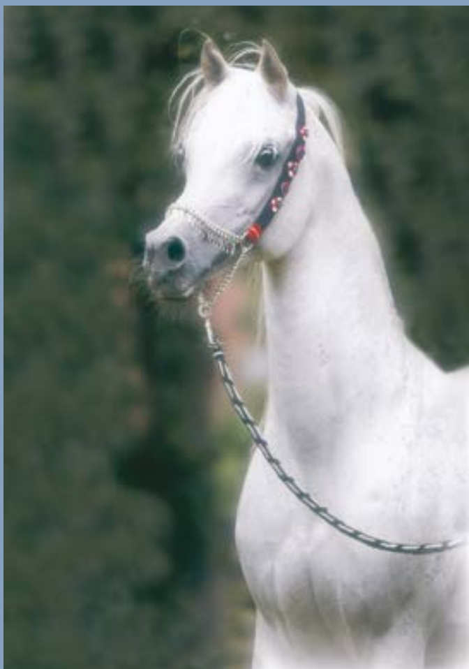
Salaa El Dine (Ansata Halim Shah x Hanan)