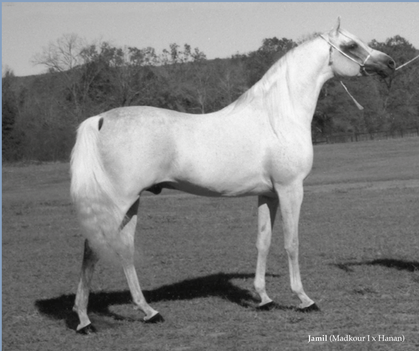
Jamil (Madkour I x Hanan)

comparing these carefully chosen ones with the best local ones in Iraq or Syria, there was no doubt they all were in principle still of the same type; no similarity with the Egyptians at all.