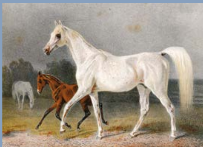
Painting by V. Adam.

Arabians must decide in the end for a very particular breeding programme, which would recognize traditions and beliefs, data and conditions as set and dictated by nature, and by finally applying all advanced knowledge in animal breeding.