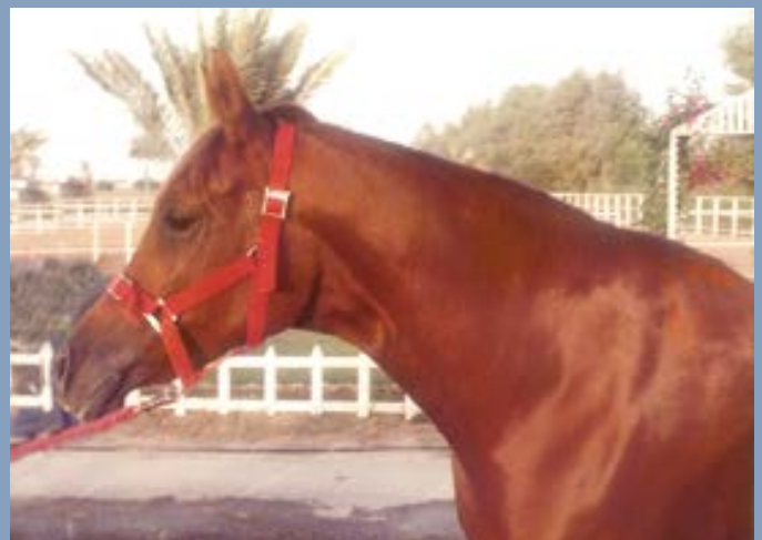
The best head of an Arabian mare in Iraq Photographed in 1989.