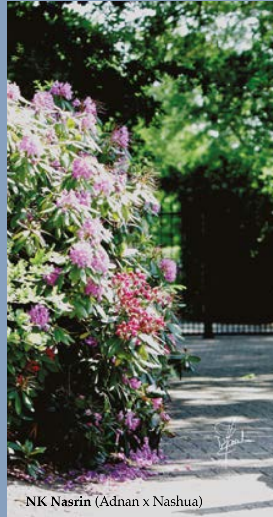
NK Nasrin (Adnan x Nashua)

The Abbas Pasha's views are documented in his famous "Abbas Pasha Manuscript". His emissaries, who searched for him for the best Arabian horses, travelled to the Bedouin tribes living in the Peninsula, but also appeared in the north of Syria, since many Bedouin tribes left the Peninsula due to a big drought in the early 19th century and settled with their goods and horses in the north. In this even sometimes confusing manuscript one can find valuable information about the Bedouins and their knowledge about their horses, their origin, their genealogy, and the way, they were bred. Mr. Palgrave travelled under the cover of a medical doctor from Palestine to Riyadh and gave the best detailed report and description of the Arabian as he saw them at that time in the stables of the Great Sheikh in Riyadh. He described them as follows, with a convincing accuracy, as the noblest creature to be in Arabia; these were the Southern type of Arabian horses.