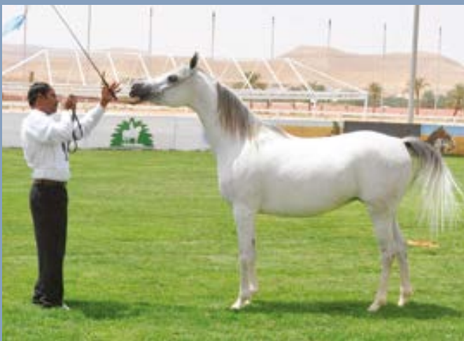
A Saudi Arabian mare belonging to their special breeding program for local Arabians.

As already mentioned, these Arabians in Egypt looked totally different from what I had seen during my different travels in the Middle East as Syria, Iraq, Saudi Arabia and even Iran or when I made the inspections on behalf of WAHO in these countries. But this population in El Zahraa was also different from the ones bred in the Babolna Stud, different from those in Crabbet Park, even when a lot of their horses were brought from Egypt to this Stud, but as known, later crossed with Syrian