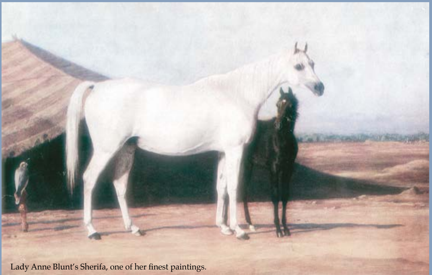
Lady Anne Blunt's Sherifa, one of her finest paintings.