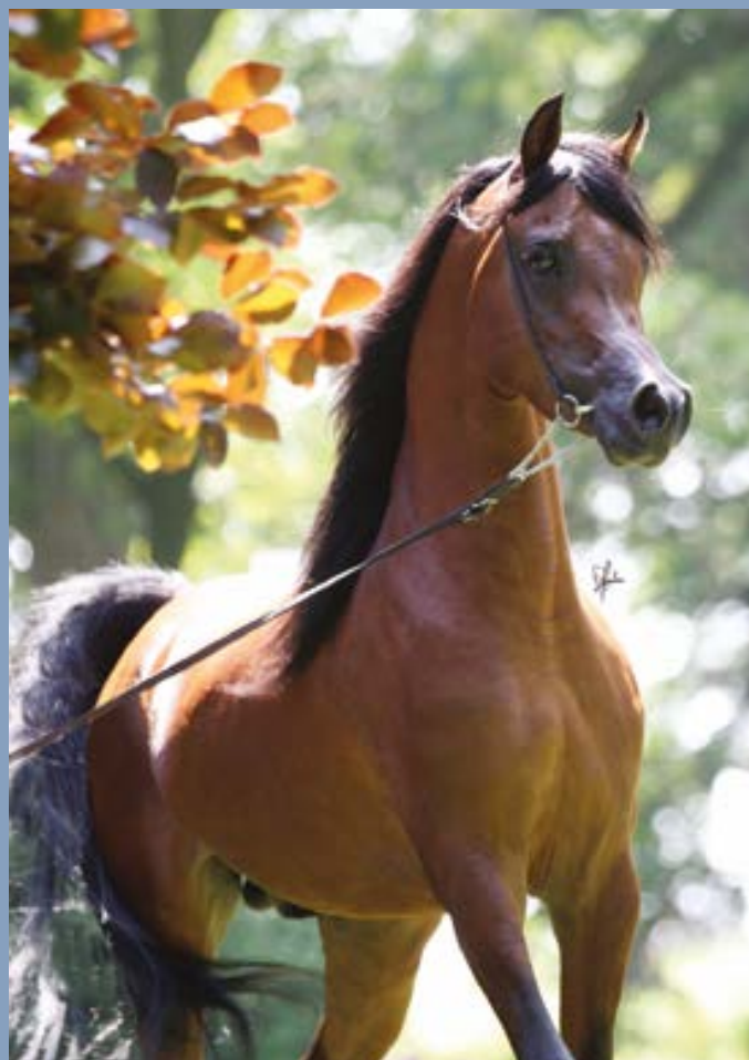
Nabhan (NK Nadeer x NK Nerham)

The Katharinenhof breeding programme is consequently built on these three principles: