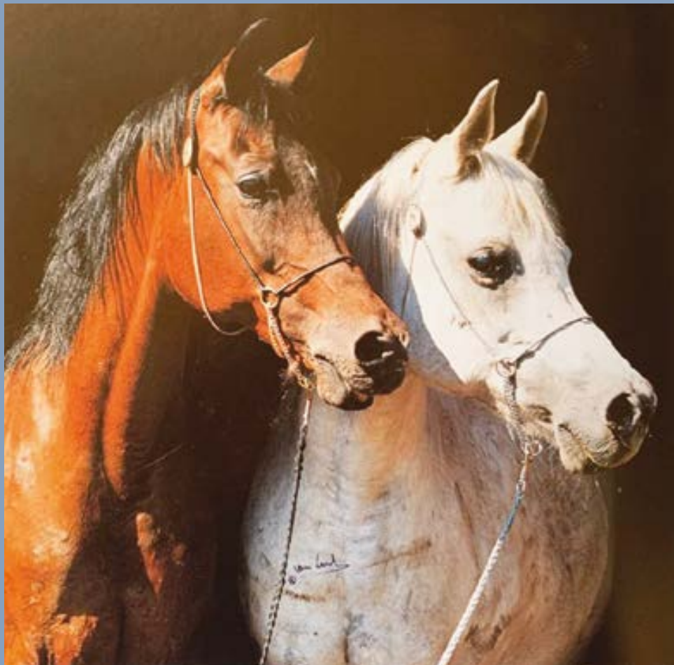
The two root mares Hanan and Lotfeia in their old age, both over 20 years old.