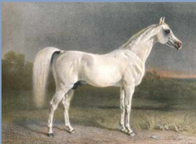
Painting by E. Volkers.

Arabians in the Stud of the King of Württemberg, Germany (around 1875).