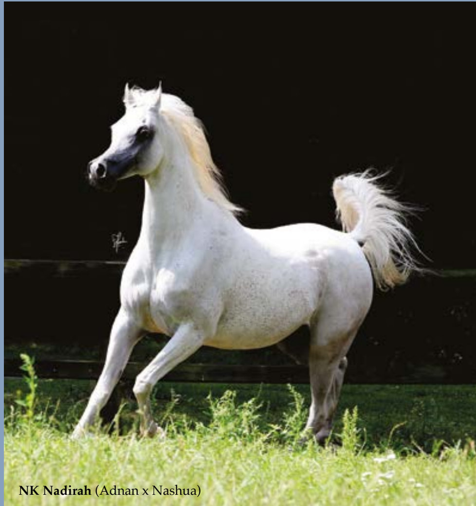
NK Nadirah (Adnan x Nashua)

did print-pots exist in Nejd; a most intelligent and yet a singularly gentle look, full eye, shape thorn-like little ear, legs fore and hind that seemed as if made of hammered iron, so clean and yet so well twisted with sinew; a neat round hoof, just the requisite for hard ground; the tail set on or rather thrown out at a perfect arch; coats smooth, shining, and light; the mane long, but not overgrown or heavy; and an air and step that seemed to say "look at me, am I not pretty?" (W. G. Palgrave, 1867-68).