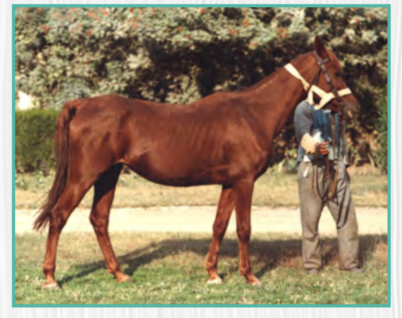
Safinaz (Alaa El Din x Ramza), shown here in old age at the EAO. She was considered a "second Moniet" in type. She is of the Kuhaylan Kroush strain and dam of Ibn Safinaz.