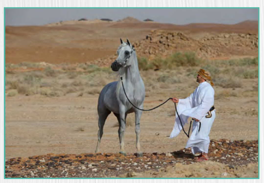
Alfabia Jumeira (Phaaros x Grea Bint Khattaara) tracing to Ameena via Omnia. Owned by Alfala Stud - KSA.