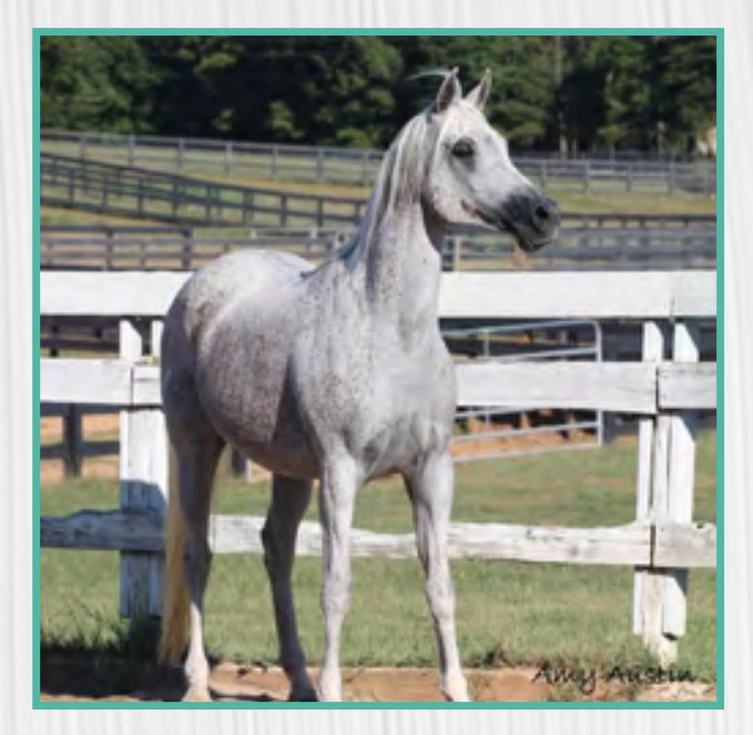
Temima (ZT Faa Iq x Tasaqqara) a beautiful broodmare at Talaria in the US. She is tail female to Bint Rissala and has 5 crosses to her.

Shah Zoom, sired by Ansata Shah Zaman (Morafic x Ansata Bint Mabrouka) and out of Bint Shahbaa I (x Gassir). Of course one of the famous sons of Safinaz was Imperial Egyptian Stud's Ibn Safinaz. Sired by the high quality and masculine stallion Seef, Ibn Safinaz produced many fine daughters from a variety of strains.