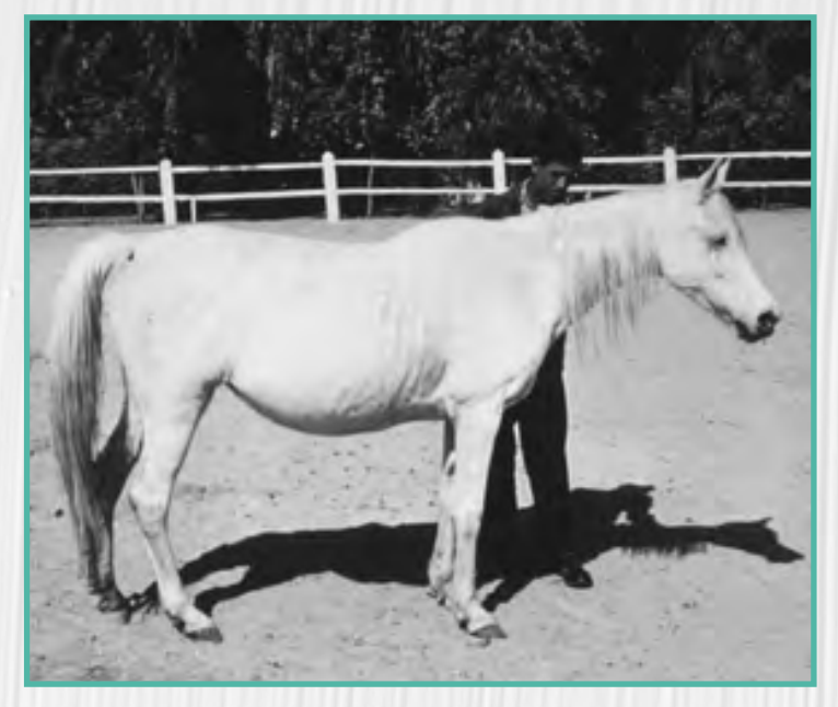
Ameena (Hamdan x Yaman) foaled at Inshass Royal Stud in Egypt pictured in old age. Ameena's descendants possess a certain magic with many refined and beautiful descendants.

Sonbolah (Sameh x BInt Om El Saad). Everyone who ever saw her in person loved her, she was unforgettable. Her famous descendants include the exceptional sire, ZT Faa Iq who has 4 lines to Bint Rissala, and in turn he is the sire of the stunning champion Phaaros, a classically beautiful horse and great sire on several continents.