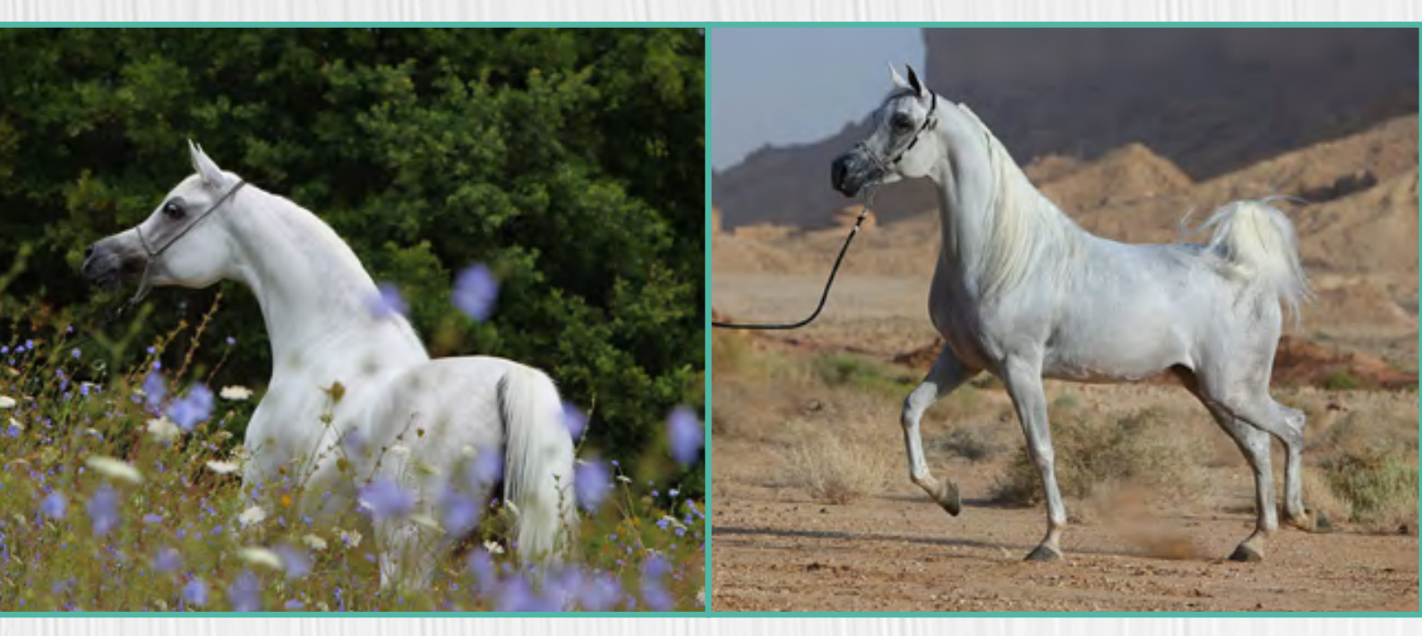
The magnificent Grea Bint Khataara, key progenitor of Bint Rissala's line from Omnia, and dam of Alfabia Jumeira. Both owned by Alfala Stud.

Bint Khattaara (x Moroc), dam of the stunning mare Alfabia Jumiera (x Phaaros), who combines perfectly the Bint Riyala and Bint Rissala lines with high percentages of Dahman and Saklawi.