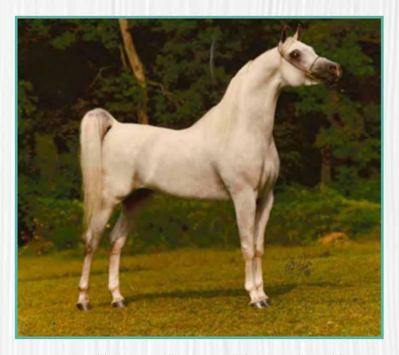
The incomparable international champion and sire of champions, Imperial Imdal, a Kuhaylan Rodan of the Bint Riyala dam line.

Bint Rissala, though related to Bint Riyala was a different type of mare resembling more her sire Ibn Yashmak. She was tall, elegant and tended to produce size, elegance and brilliant motion. Interestingly Bint Rissala was the highest percentage of Abbas Pasha/Ali Pasha Sherif breeding at 87.5% and it seemed to show persistently in the elegance of her line. With 13 foals she was