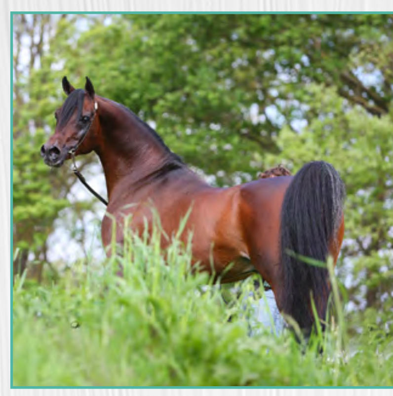
ZT Faa Iq (Anaza El Farid x ZT Jamdusah) a superior sire with 4 crosses to Bint Rissala, one of which is his tail female to Serenity Sonbolah. Owned by Al Rashediah Stud.

very prolific at the EAO. One of her most universally admired grandsons is the classically handsome Alaa El Din (Nazeer x Kateefa), an extraordinary sire of superior producing mares, including the immortal Hanan. Kateefa's grandson Farag (x Morafic) was a much admired and beautifully photographed stallion who sired many magnificent horses. There are so many champions credited to the Bint Rissala line that it could create a separate chapter. Another stunning stallion of the Bint Rissala line was the incomparable El Mareekh who I will never forget seeing his brilliant presence at the US Egyptian Event in the 1980s. Certainly among the most universally admired females of the Bint Rissala line was the incomparable US National Champion mare Serenity