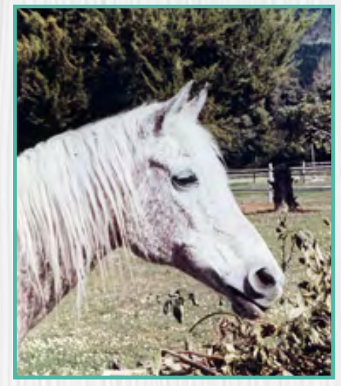
Baraka (Ibn Manial x Gamalat) in old age in South Africa. She was the last of the celebrated Kuhaylan Mimreh strain, the strain of Nazeer's sire Mansour.