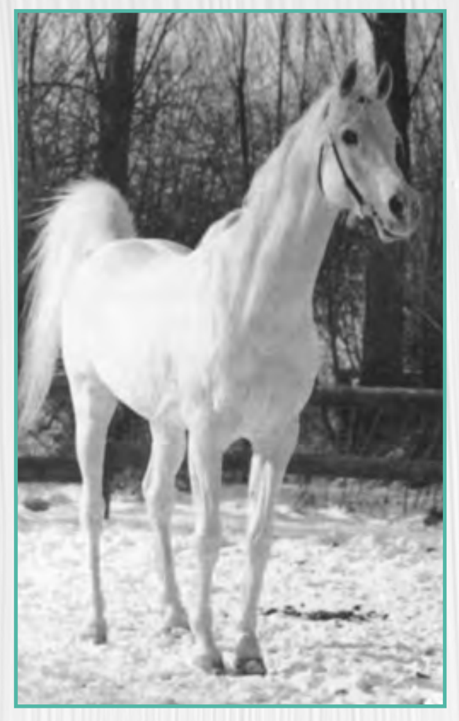
Farag, (Morafic x Bint Kateefa) a classic stallion whose dam was a granddaughter of Bint Rissala. An influential sire in Europe.

very prolific at the EAO. One of her most universally admired grandsons is the classically handsome Alaa El Din (Nazeer x Kateefa), an extraordinary sire of superior producing mares, including the immortal Hanan. Kateefa's grandson Farag (x Morafic) was a much admired and beautifully photographed stallion who sired many magnificent horses. There are so many champions credited to the Bint Rissala line that it could create a separate chapter. Another stunning stallion of the Bint Rissala line was the incomparable El Mareekh who I will never forget seeing his brilliant presence at the US Egyptian Event in the 1980s. Certainly among the most universally admired females of the Bint Rissala line was the incomparable US National Champion mare Serenity