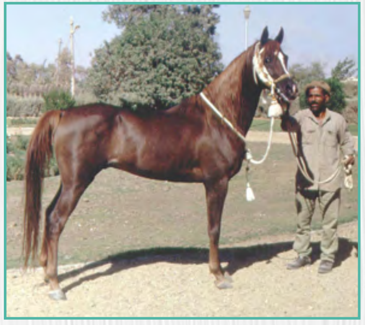
The great EAO sire Alaa El Din (Nazeer x Kateefa), a grandson of the mare Bint Rissala, and sire of many superior producing mares.