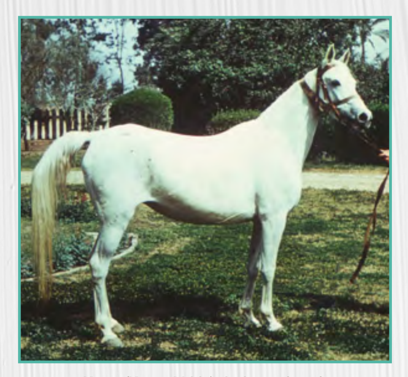
Nazeera (Nazeer x Malaka) a lovely mare of great finesse tracing in tail female to Bint Riyala of the Kuhaylan Rodan strain. Dam line of World Champion Imperial Imdal and other champions.