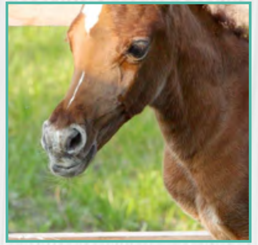
The future from Omnia's line, Nazeera Le Soleil (Phaaros x VP Athalheid). Bred and owned by Le Soleil Stud.