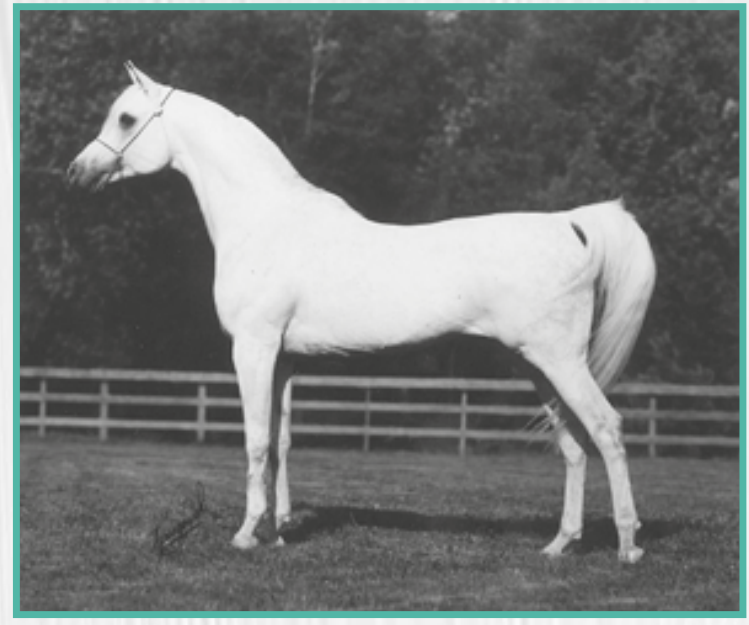
Prince Fa Moniet (TheEgyptianPrince x Fa Moniet) an extremely prepotent sire representing intense Saklawi on the dam line of Bint Yamama.

The celebrated Bint Yamama line from Prince Mohammed Ali was originally recorded as Kuhaylan