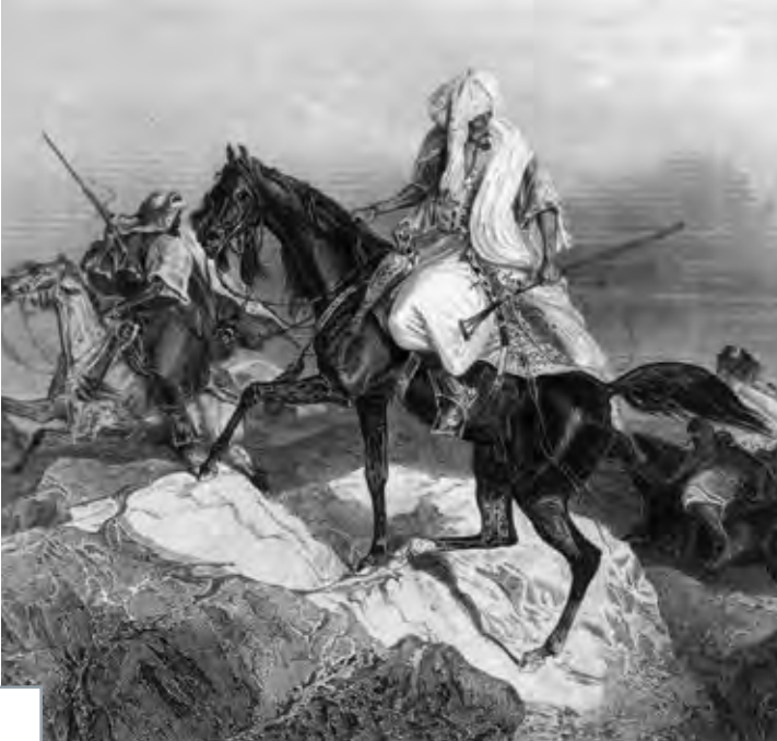
The Arabian in its homeland, trained to surprise the enemy in the frequent local wars

Movement, the next component of type. Previous Arabian breeders did not think so much about halter judging. They liked to see a horse move. "Close your eyes and you should not hear your horse in trot." So easy, so elastic an Arabian should fly over the ground that hoof beats do not seem to exist. An Arabian is, so to say, a light-weight horse, less than what is ever average, a fine product of desert life and an environmental relative to the gazelle of this region.