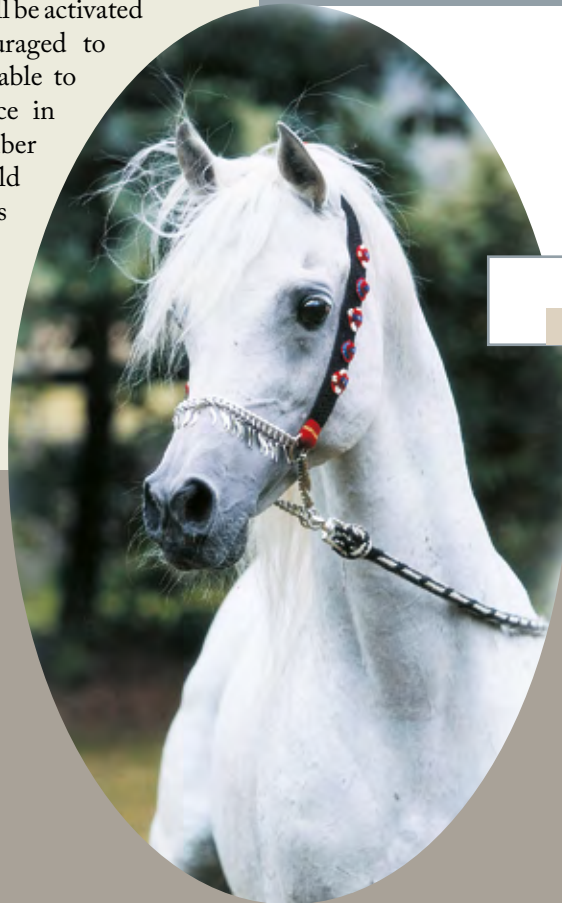
The fierce expression of a stallion's head, masculine and powerful, acting as a trademark of the breed