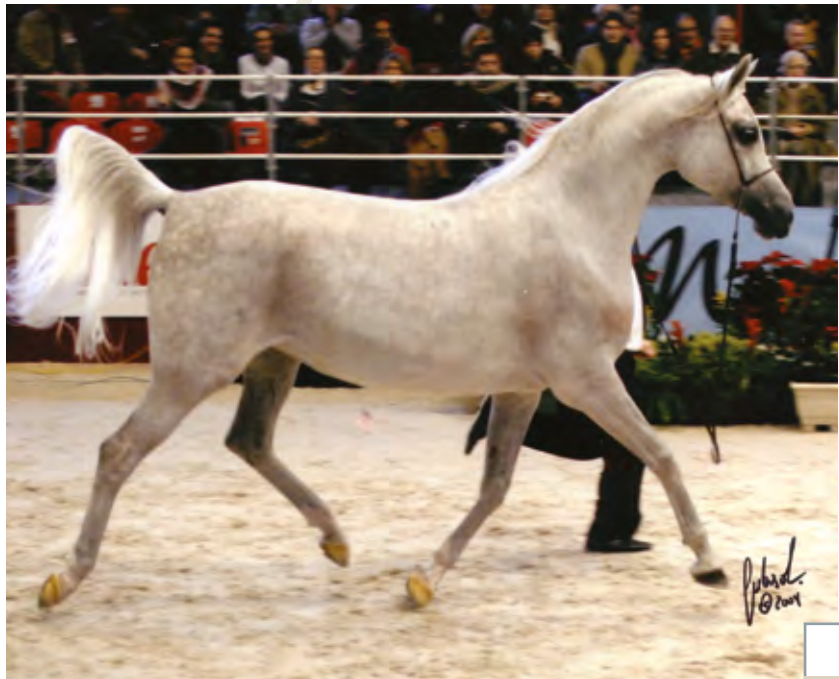
Tail carriage in perfection

Head and tail carriage are two very easily recognisable features. However, there is an additional one, which might be claimed by other horse breeds as well, but it is definitely deeper and more solidly settled within the Arabian breed. This refers to their skin and to the incomparable dryness of this breed. A fine skin must make muscles, bones and veins clearly visible. The skin should be so delicate and fine that all the physical details which are placed and hidden underneath the skin penetrate to outside. An Arabian horse should show texture and should look dry. Accordingly, expressed in a negative way, a thick skin is not in conformity with the Arabian breed. It covers the body like a heavy blanket. Texture creates the impression of life, a flat surface suggests a rather inorganic entity, impossible to animate.