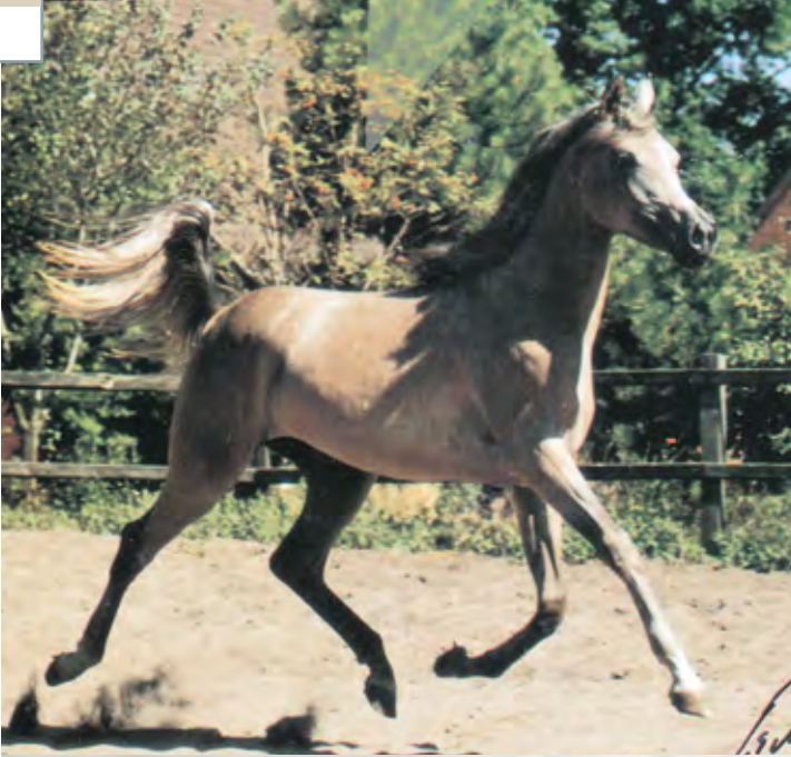
The easy flying trot of a young mare