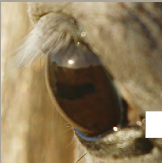
The wondergul black eyes, round and big, are the most attractive part of the head

There is a strange, regrettable observation: While Arabians with such black, large, wonderful eyes are getting rare, the so-called “dished head” is in advance. It looks like an unfortunate correlation, which should be followed up with care. A big eye is a feature which could be improved by selection.