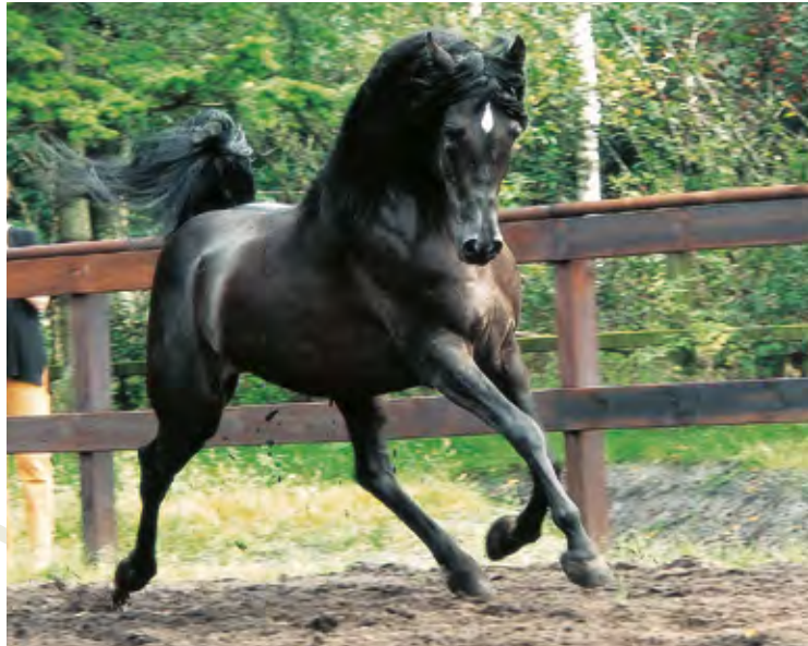
A stallion in action, showing his masculine behaviour