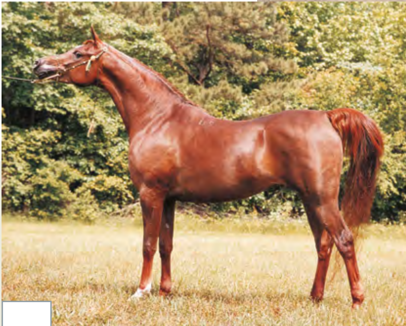
...and a perfectly balanced Arabian brood-mare, highly evaluated by showmen and breeder people

This all indicates that there is plenty of room for interpretation and still more need for explanation as to what is the meaning of each of the 5 categories and how one could come closer to a proper common application and understanding. On the next pages, reference will be made to “type”, “head” and “neck”. The category of type is maybe the most difficult and complex one and common understanding is not easy to reach. The main reason is the fact that no objective measurement exists for type. It cannot be measured in meters, in time or weight. And in addition, type is not a single feature. The word “type” covers a summary of different features. It is a composition of qualities and features which could be ordered as follows: