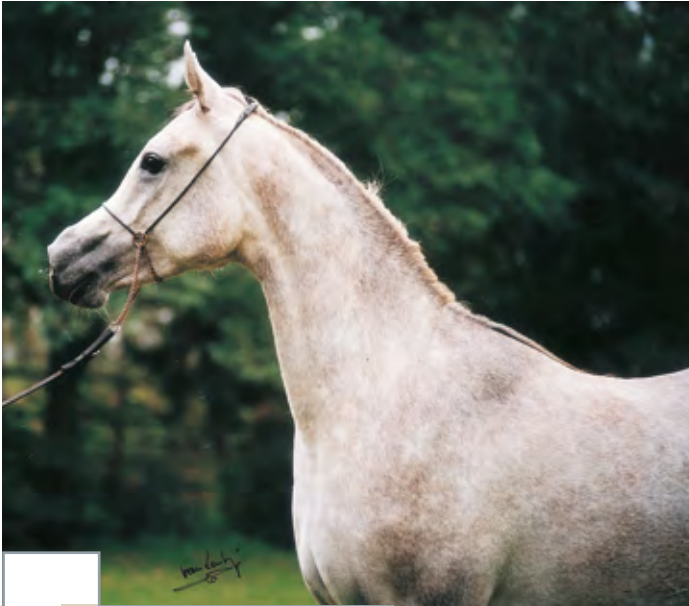
The light elegant neck of a young female

Good necks are not too difficult to breed; they are well settled in several Arabian horse families. However, even good necks can go out of proportions when Arabians are overfed. They get thick and round, since fat gets easily deposited under the skin around the neck. It became a habit to present Arabians well fed and in good condition during show time. When fat is deposited on the hips, loins and quarters it is found consequently and well in abundance on the neck. Sweating by the use of “neck sweats” are the answer; a procedure which is disliked by many people and since a certain time under a very controversial discussion. Like this, the neck is kept lean and the rest of the body shows well-conditioned, a good solution?