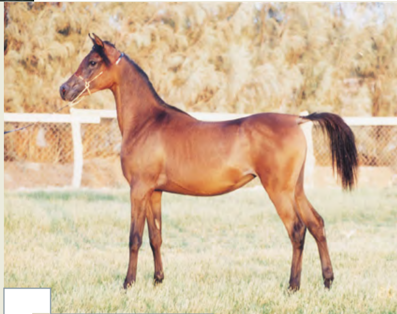
A typical young female with an attachment of her neck on the shoulder and at the “mitbah”

The upper side of the neck should connect at its lower end to a wither; a smooth line from the neck directly into the back is undesired. And finally, again the sex appeal: a stronger well-arched stallion-neck, proudly carried and maybe even broader and in contrast a leaner, finer and more straight neck of a female.