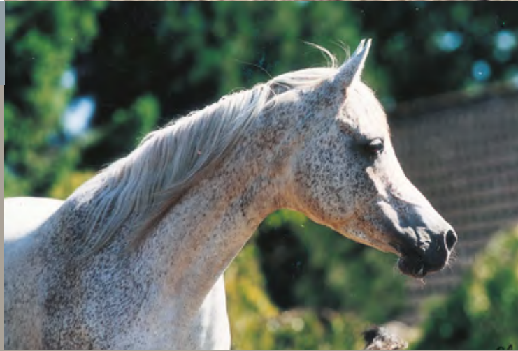
The soft and quiet look of a female face

Finally, a last 5th consideration refers to sex appeal. Stallions must look like males and mares as females, clearly and without any doubts recognisable as those. An Arabian stallion should show at least the following prominent masculine attributes: Powerful movement, a well-arched stronger neck and a proud carriage of his head. All three are important features of masculine behaviour. Such proud behaviour of a male in whatever breed, sometimes entering ridiculous dimensions, is one very basic tool of natural features of masculine behaviour. When in great shows the note “20” appears on the screen for “type”, have all these above points been well considered? Judging was perfect, when in this one note all these different components were properly summed up which enter into the evaluation of type, like: Balance and presence, the unique shape of head and carriage of tail, the fine texture of skin, the elegance and balance in movement, the size of their body, the pride of a stallion as well as the sweetness of a mare? The fact that some experienced judges enter their note for type only at the end of the whole judging procedure on their document, indicates that they are on the right track for proper and comprehensive evaluation.