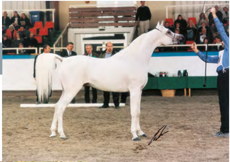
A well-balance pure-bred Arabian stallion....