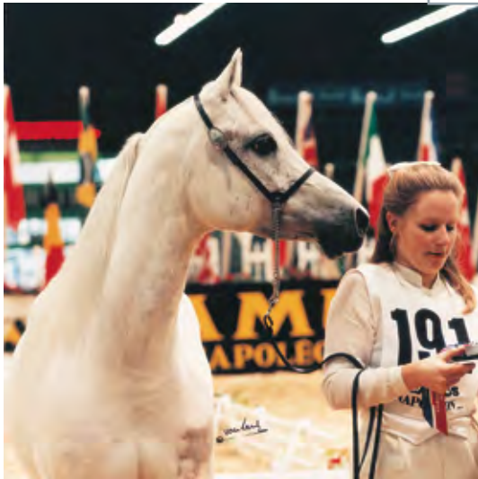
An Arabian head in the side view. Again, the tringle must not be overlooked

The head should form a triangle, seen from the front and as well from the side. The small mouth-muzzle and the broad front of the upper head, enlarged by clearly extended eye sockets, form this shape as a front view; again, the small mouth/nose combination on the lower part and the properly medium-sized, but round shaped jaws appear as a triangle from the side view. If these triangles appear compact, a shorter head is formed. If they are stretched out, a longer head is the result. But in all cases, the triangle shape must be clearly recognisable and never be lost.