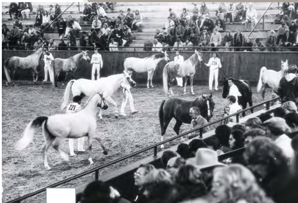
The point-judging-system is applied in all major shows in Europe, like in the Nations Cup in Aachen or the world Championship in Paris

The five well known categories, as type, head and neck, body and topline, quality of legs and movement are the cornerstones of judging today. Nearly every Arabian horse breeder in Europe knows about them and even when it comes to buy a horse, most of the buyers might think in their mind in these terms before they take a decision. Visiting observers and owners follow in horse shows the known judging procedure in even giving their own points, but still many of them leave the event with a shaking head indicating they could not follow properly why judgement was done this way and not the other.