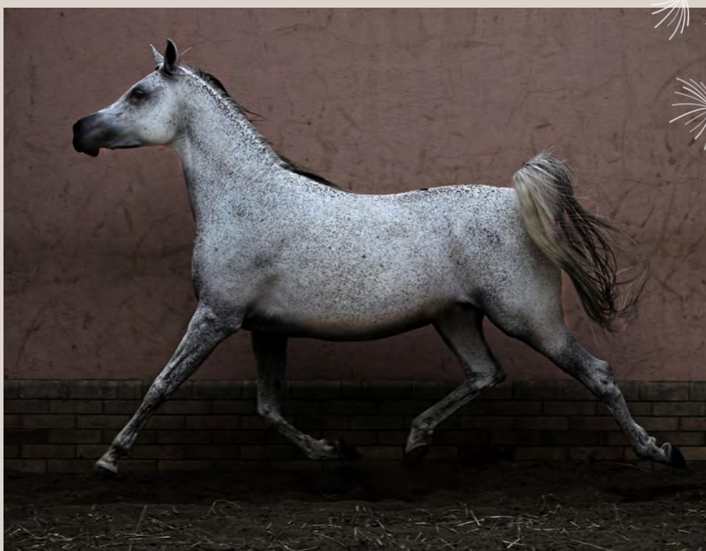
Asfourat Albadeia (Farid Albadeia x Simeon Safir)