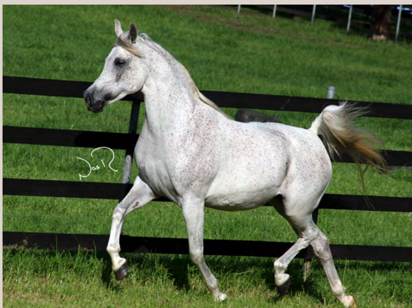
The extraordinary mare Ibtebag Albadeia (Badran Albadeia x Halawat Albadeia), four times Egyptian Champion mare.