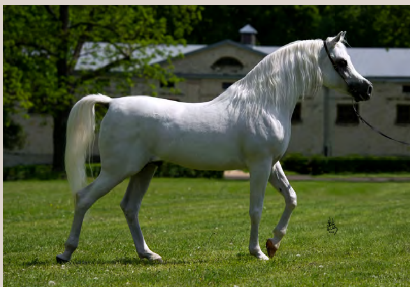
Haytham Albadeia (Simeon Sharav x Galagel Albadeia)