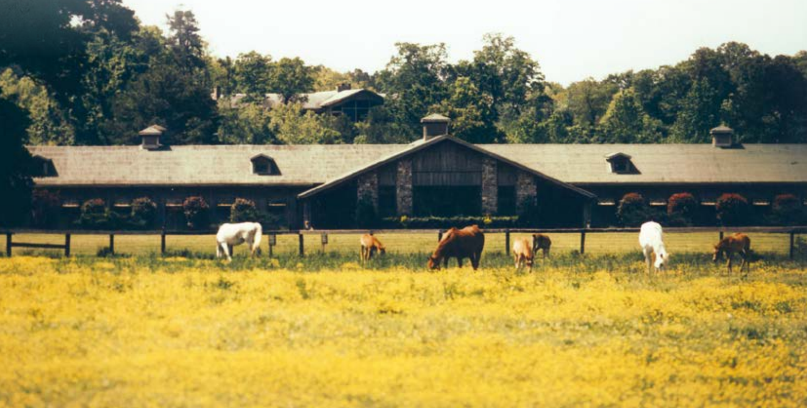
Ansata Arabian Stud in Mena, Arkansas