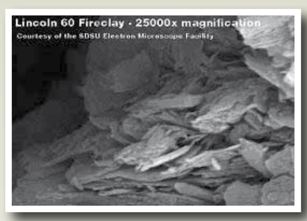
that have a anionic or negative charged surface built with oxygen (O2) or hydroxide (OH) and a central cavity hold by a cationic or positive charge element (Si, Al, Fe, Mg) to balance forces and stabilises the structure.

Those elementary bricks are tetrahedrons and octahedrons